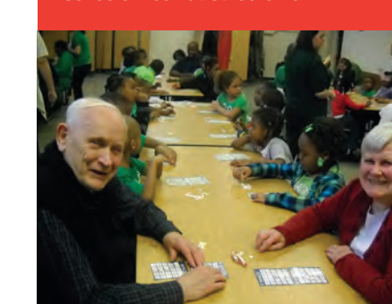
Parishioners enjoy bingo with St. Jerome students during Catholic Schools Week. — Channele McCloud

GRAND OPENING! SWEEPSTAKES INTERNET CAFÉ!