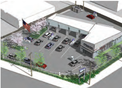
Come visit the Soft Cloth Tunnel at the new American Pride Car Wash at Lakeshore and E. 156th.

We have great employees and very low turnover. Our average employee has been with us for 10+ years. We've never laid off an employee due to lack of work; we know how important it is to keep