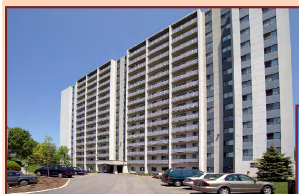
Euclid Beach Villa 125 E. 156th Street, Cleveland, Ohio (216) 531-3820 * TTY (216) 472-1884 Seniors 55 & Older

Tour our Senior Properties today and See what WE have to Offer!