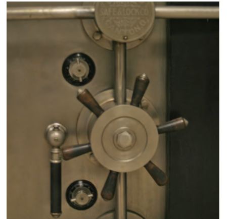
The top floor of the old Key Bank building on Waterloo is the location of the new KaleidoArts Productions “creative business incubator.”

KaleidoArts Productions is a nonprofit collective of young local independent artists. Its mission is to enrich the community by providing support and resources to young independent artists through the collection, presentation, and production of local fine art. Saturday, March 3rd is an open house to give you a chance to come down and see their vision for the future of this space, and to see if you want to be a part of it. There will be live music, DJs, independent film, and a silent art auction from 5pm-10pm. For more information