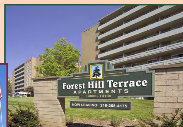
Forest Hill Terrace 14030 Terrace Road, E. Cleveland, OH (216) 268-4175 * TTY (216) 472-1884 Seniors 55 & Older