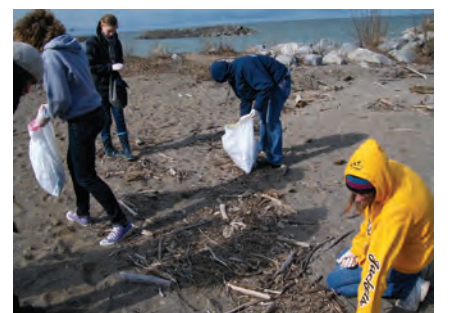
Saving the Great Lakes one cleanup at a time!

Check out our next lineup of cleanups for Spring/Summer 2012! Saturday April 21-Global Youth Service Day, Saturday, May 19 10am-12pm, Saturday June 16 10am-12pm. More dates and events to come!