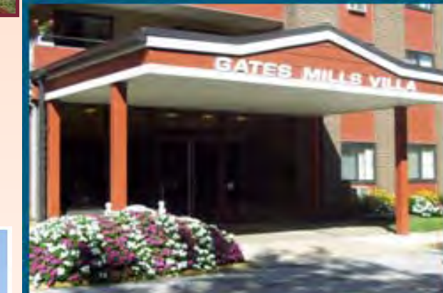
Gates Mills Villa 6755 Mayfield Road, Mayfield Hts., OH (440) 461-2294 * TTY (216) 472-1884 Seniors 62 & Older