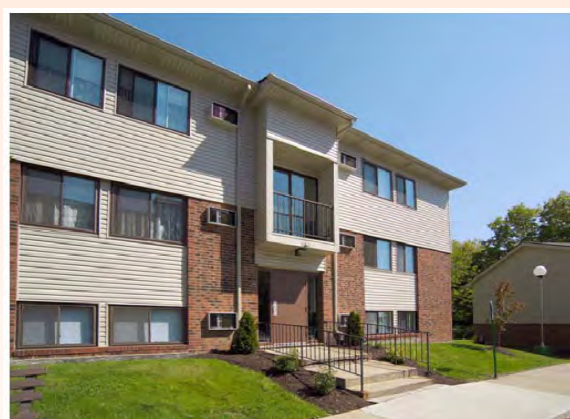
Euclid Hill Villa 100 Richmond Road, Euclid, Ohio (216) 289-4090 * TTY (216) 472-1884 Seniors 55 & Older

Amenities include: Community Room w/Kitchen, Movie Theater, Computer Lab, Resident Library, Fitness Center, Beauty Salon, Mini-Mart and More!