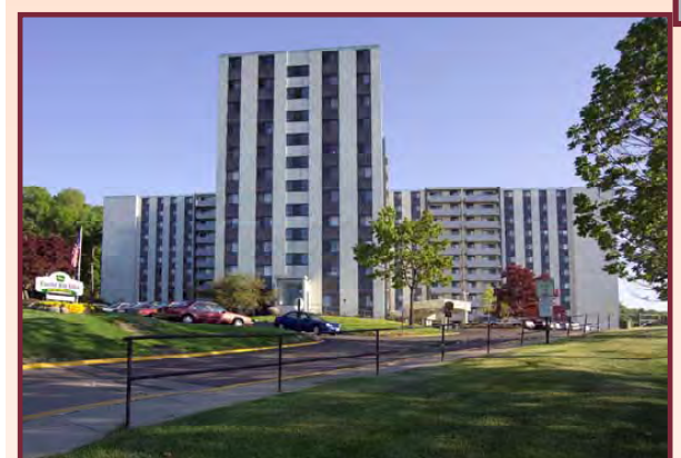
Owl's Nest 2020 Taylor Road, E. Cleveland, OH (216) 541-4472 * TTY (216) 472-1884 Seniors 55 & Older