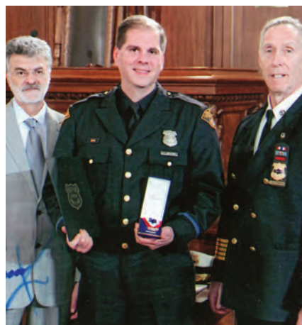
HONORED – Officer Edward Csoltko (center) accepts his Medal of Heroism as Mayor Frank Jackson (left) and Police Chief Michael McGrath look on.