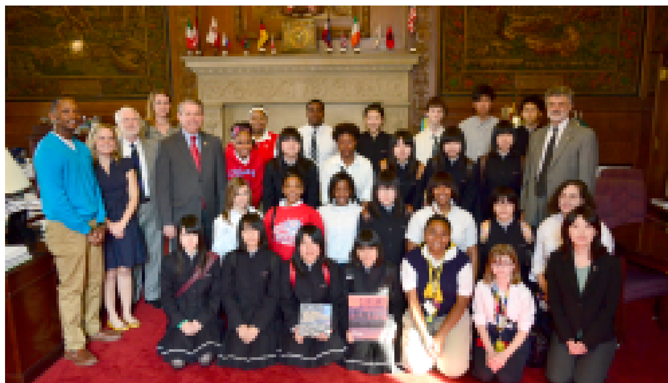
Villa Angela-St. Joseph High School students and Japanese students from Shizuoka St. Charles High School in Japan pose for a group photo in front of City Hall.

The mayor and the Japanese students presented each other with photographs taken with the mayor. The mayor signed the photos for the students.