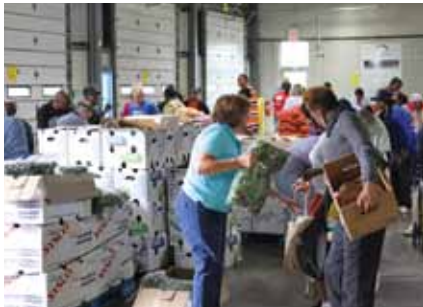
Cleveland Foodbank's "Produce to People" Distribution, 3rd Thursday of every month from 4-6 pm for income eligible residents.

Call today and we can guide you through the application process step-by-step. If you have questions about eligibility, finding food pantries in your area, or what benefits you might qualify for, please call our Benefit Outreach Counselors at (216) 738-2067.