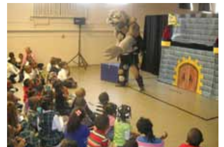
Students at St. Jerome School get front row seats to nationally recognized puppet show.