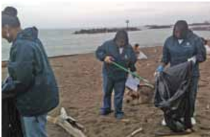
Volunteers from Cleveland Division of Water tallying trash and taking names!

whether its warm or cold and wear tennis shoes. Coffee and snacks will be provided and lunch afterwards at one of Collinwood's many great restaurants. The team that picks up the most trash will also get a special prize...for real!