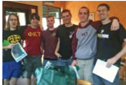
Phi Kappa Tau brothers enjoying some Chili Peppers tacos after a some hard work!

We will be celebrating Earth Day and Global Youth Service Day. Volunteers will meet in the park pavilion at 10am. Gloves, trash pickers, rakes and bags will be provided. Please dress for the weather