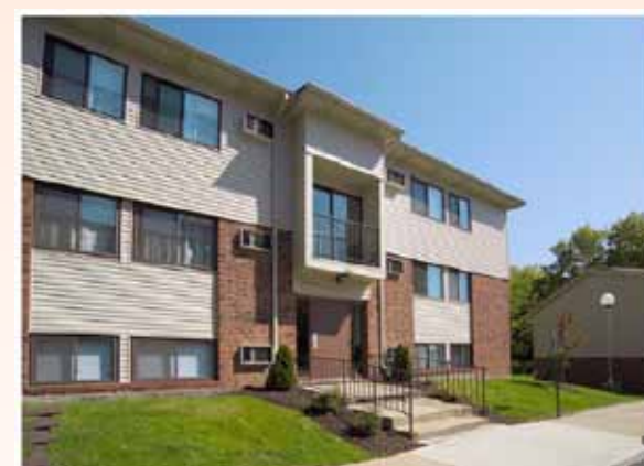
Euclid Hill Villa 100 Richmond Road, Euclid, Ohio (216) 289-4090 * TTY (216) 472-1884 Seniors 55 & Older

Amenities include: Community Room w/Kitchen, Movie Theater, Computer Lab, Resident Library, Fitness Center, Beauty Salon, Mini-Mart and More!