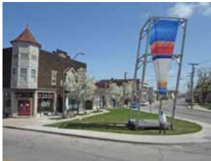
The Wedge, by Abe Olvido, is the newest art installation at Arts Collinwood.