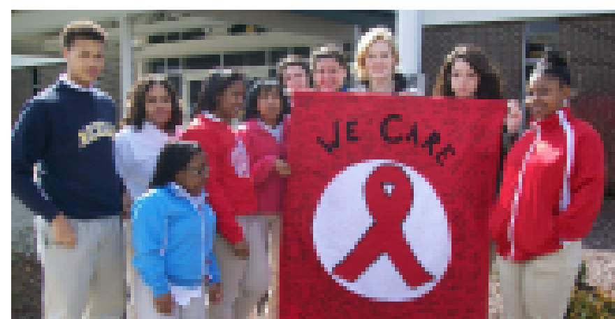
Villa Angela-St. Joseph High School students and Chardon High School students pose for a group photo in front of City Hall.

Both schools were very supportive of Villa Angela-St. Joseph High School. The students of Chardon High School displayed an expression of support for the upcoming community.