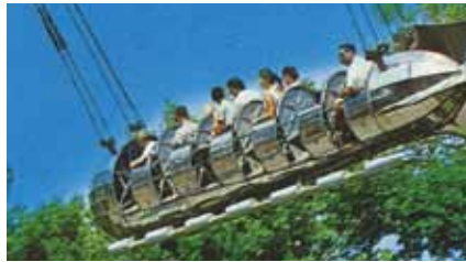
And then there's the one about the Rocket Car landing at the Terminal Tower.

Didn't happen. Have never been able to find any news story about any such thing happening either—and you know that if this had happened, the headlines would've been HUGE!