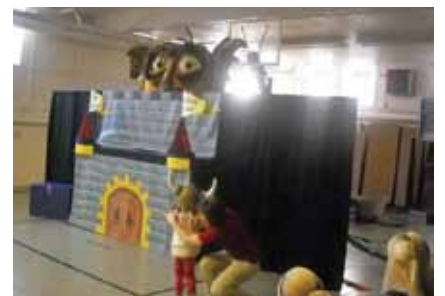
St. Jerome School Students enjoy a monster filled puppet show.