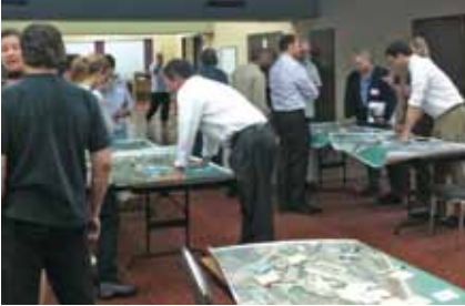
Residents write comments and MSI-KKG architects take notes and listen!

If you are interested in getting involved with the Euclid Beach Redesign or have