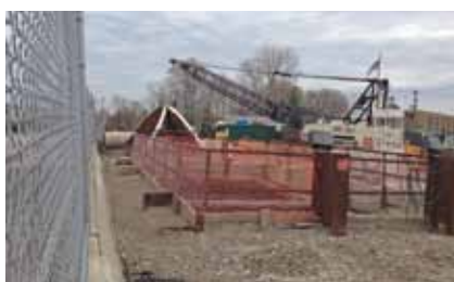
Vibration monitors make sure the blasting is within specified limits at the Triangle excavation site on Lakeshore Blvd.

itself begins, a massive boring machine (even now traveling to Cleveland) will p-u-s-h through the earth from Bratenahl to Nottingham, emerging at approximately Nottingham and E185 to be taken apart and sent home. (This conjured up images of an immense worm tunneling through the earth, which sent me off to Google ouroboros, but that turned out to be the snake swallowing its tail and symbolizing completeness.)