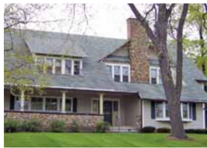
The Delaney home is recognized today as the Administration Building of the Rose Mary Center.

Rose-Mary Center provides residential, habilitation and education services, medical, dental, psychiatric and nursing