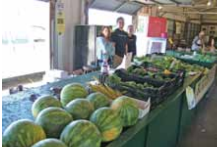
The Coit Road Farmers Market in action!

Community Support: Grow your EBT/food stamps, proudly accepted at the Coit Rd Farmers' Market. Ohio Direction Card Users get $5 in additional tokens to spend for the first $5 charged to the card. A new incentive for produce will begin this season with a $20 match. There's time to participate in The Coit Urban Farm Cooperative to grow and sell on the Coit Rd Market site. Interested? E-mail com-laser@gmail.com or call (440) 376-9448.