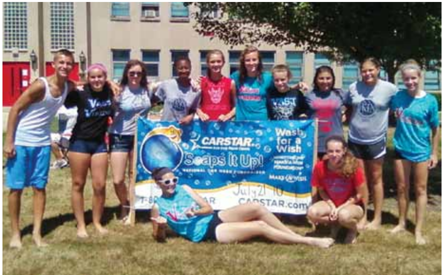
VASJ Viking Volleyball team ready to “Soap It Up”!