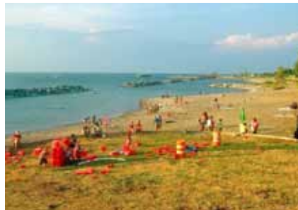
A pool noodle obstacle course in the Euclid Beach Park fountain.

cleanup on Saturday September 15th from 10am-12pm! And if you are really feeling inspired, check out our Urban Beach Ambassador training session on Saturday August 16th from 630pm-830pm in the pavilion at Euclid Beach. Be part of the change that’s making Euclid Beach and all of our lakefront parks great places to visit every day of the year (well, maybe not in January...)!