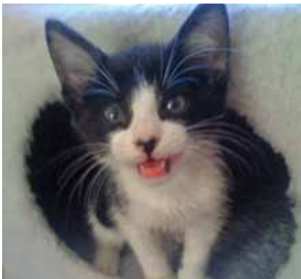
One happy little Baxter.