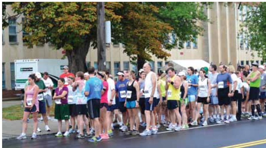
More than 115 participants came for the inaugural “Escape on the Lake” 5K Run/1 Mile Walk.