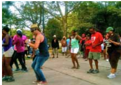
Dancing to Latin rhythms with Son Gitano.

Can’t wait until the next Euclid Beach Blast to take part in all the momentum at Euclid Beach!? Not to worry! Join Euclid Beach Adopt-a-Beach volunteers for our next beach cleanup on Saturday August 18th from 10am-12pm and for our Coastweeks