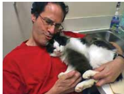
Lucky and her owner

Please make checks payable to Northeast Shores Development Corporation , which acts as fiscal agent for the Euclid Beach Feral Cat Project . Please write EBFCP on the memo line of your check and mail it to 317 East 156th Street, Cleveland, 44110. All donations are tax deductible.