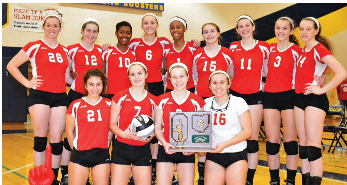
The Lady Vikings volleyball team proudly display the regional championship trophy after defeating Tuscarawas Central Catholic 3-1 in the regional finals held in Solon. It is the first time VASJ girls volleyball has won this title since 2006.