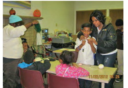
Crochet Club at work: Beginners and Experts