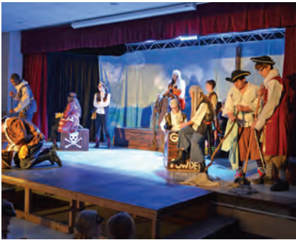
The Adventures of the Fearsome Pirate Frank featured more than 130 young members of the school and parish.