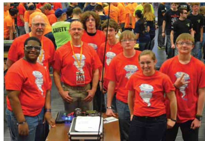
Members of VASJ's robotics team participate in the RoboBots Competition at Lakeland Community College where they tied for fifth place out of 31 teams.

When one of the teams preparing to battle VASJ didn't have their robot ready after the 30 minutes, VASJ's team chose to donate ten minutes of their time to the opposing team. This great example of the Viking spirit is what won VASJ's robotics team the sportsmanship award.