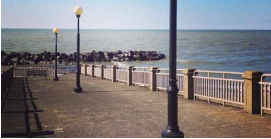
The Euclid Beach Pier is a historic piece of infrastructure that will be missed by the community. Say farewell to YARN n YOGA.