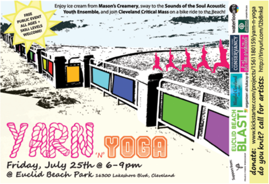
YARN n YOGA is a free event open to the community on Friday, July 25th from 6-9pm at Euclid Beach Park.