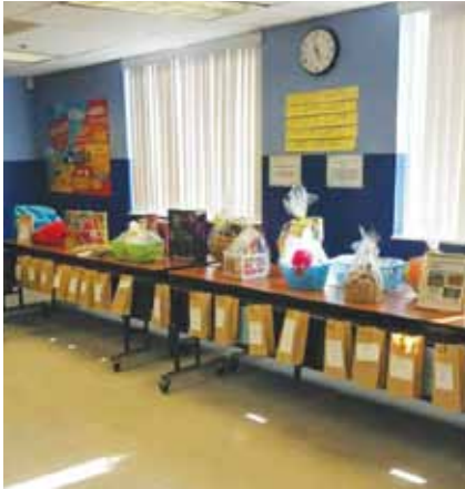
Check out all the Chinese Raffle Baskets!

tion, where they played the part of runaway slaves. This annual 5th grade trip was a success and guaranteed to be a trip of a lifetime for the students. We are excited our students experienced such an important part of history. We are so glad we could provide our 5th grade students with such a rich experience.