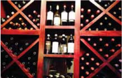
Our new wine wall