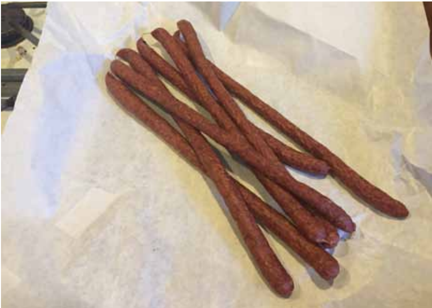
I officially declare that Azman’s Meats at 610 East 200th Street has the best Smokies in the World.

Lafamilia Restaurant opened up in the city of Euclid about nine months ago. It is a Soul Food Restaurant, family owned and operated by a husband, wife, and daughter team. Formerly Giovanni’s pizza it is located at 491 East 260th St. in Euclid, Ohio across from Shoreview Elementary next to the Classic Custard ice cream shop. The menu includes ribs, chicken, fish, greens, mac-n-cheese, bread pudding, peach and apple cobbler and more. The restaurant is closed on Mondays, but open 11:00 a.m. to 9:00 p.m. Tuesday through Thursday, 11:00 a.m. to 10:00 p.m. Friday, 10:00 a.m. to 10:00 p.m. Saturday and 10:00 a.m. to 5:00 p.m. Sunday. They also deliver within a 3 mile radius with a $20 minimum order and $3 delivery charge.