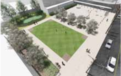
Design plans for Euclid Creek Tunnel Shaft 5, near Nottingham and St. Clair.

Summer is near, and we are going to rock n roll! Euclid Beach Live runs from June 12 through August 21. This year, they’re stepping it up with the addition of food trucks. It is hard to believe the time has come to think about the Euclid Beach Blast. Vendors and volunteers are needed. If you are interested in cleaning the beach or getting involved with the Beach Blast, check out https://www.facebook.com/AdoptEuclidBeach or www.euclidbeachblast.com .