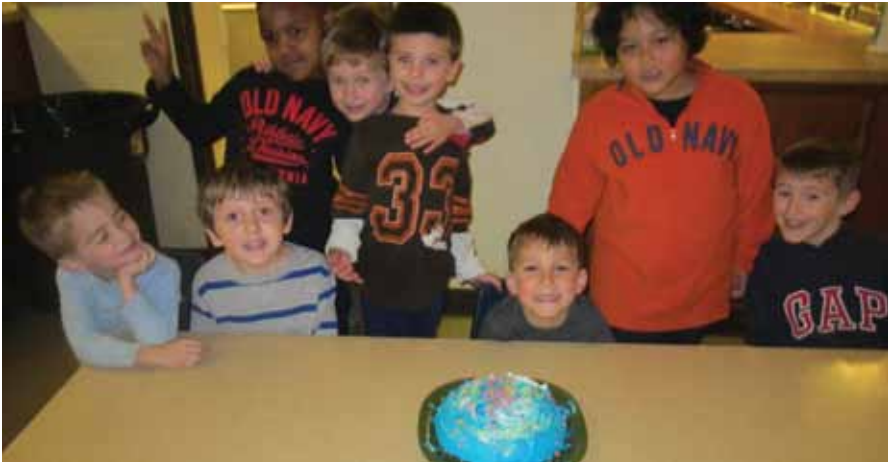
Euclid Cooperative Preschool Pre-K Class celebrated Earth Day by making an Earth Cake.

Euclid Tavern (595 East 185th Street) at 8:00 p.m. Cleveland Critical Mass will leave downtown Cleveland at 7:00 p.m., will be at the intersection of East 185th St & Lakeshore Blvd. at approximately 8:30 p.m., and will arrive at Sims Park in time for sunset. All times are estimates.