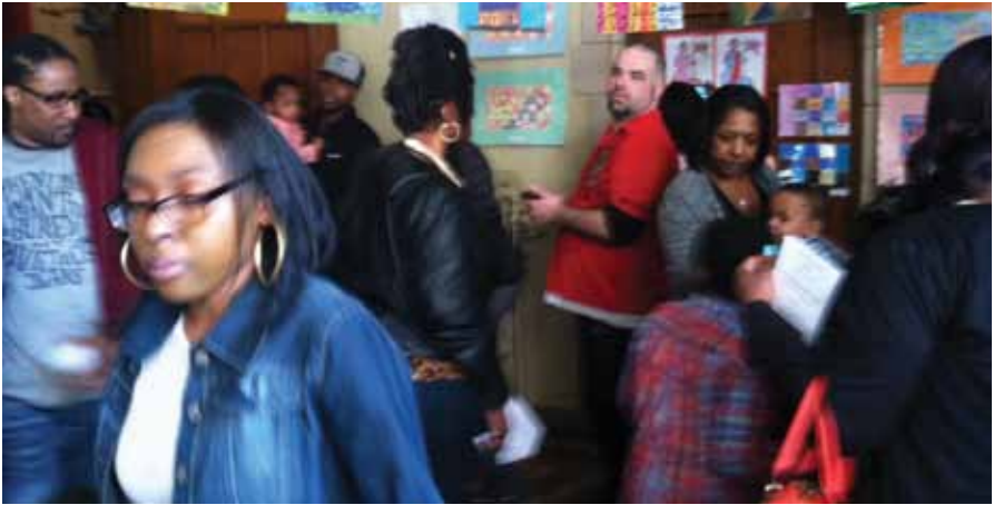
Families check out the student artwork at the First Imagine Bella Art Show!