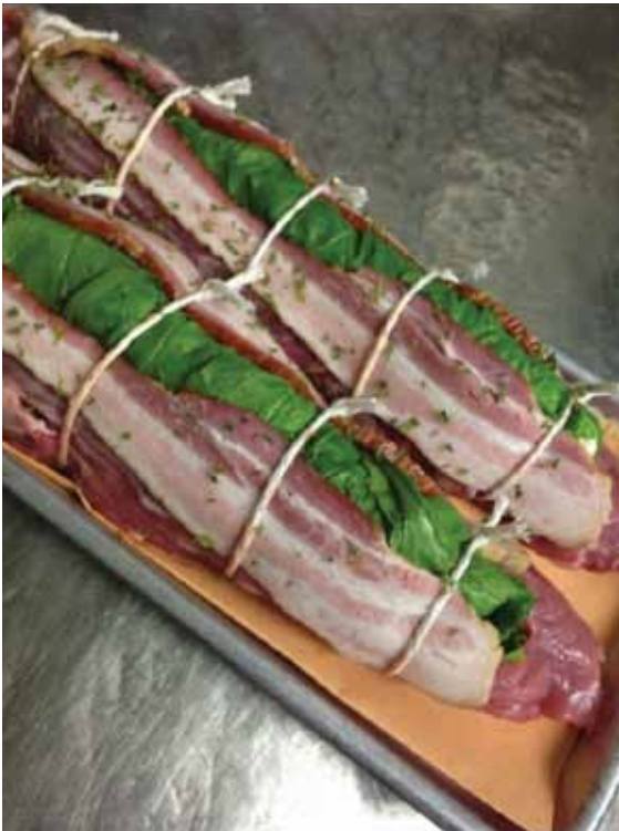
These mouth watering extra tender Pork Tenderloins are stuffed with baby spinach, cream cheese, and chopped garlic then wrapped with bacon. These, plus much more, are waiting for you at Josh’s meats, 20068 Lakeshore Blvd.