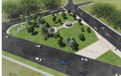
Design plans for Euclid Creek Tunnel Shaft 4, at Triangle Park.

aware, the Euclid Creek Tunnel’s shafts impacted much of our neighborhood; Shaft 4 is at Triangle Park and Shaft 5 is near the intersection of St. Clair Avenue and Nottingham Road.