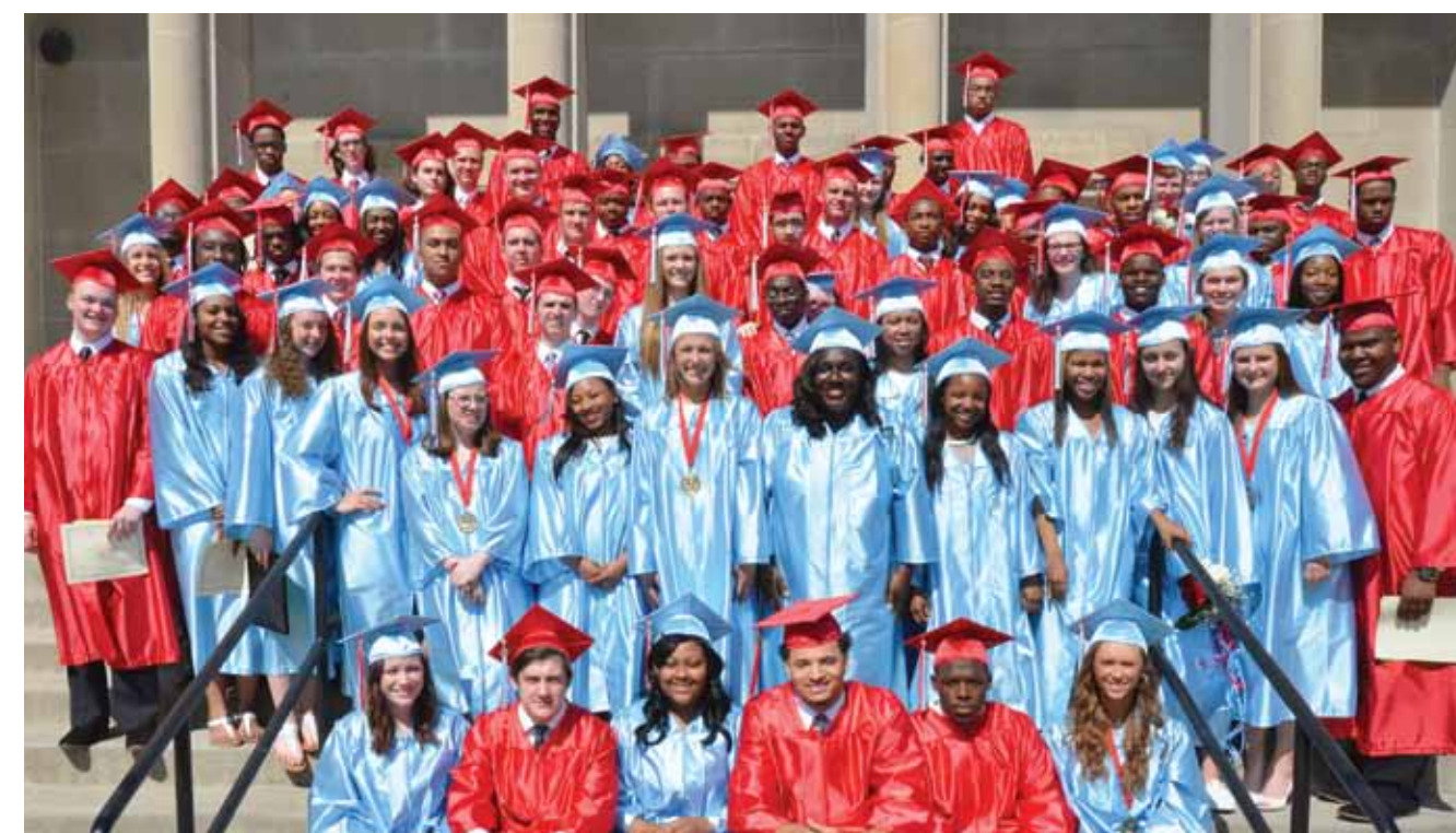
The Villa Angela-St. Joseph High School Class of 2015 gather outside of the school's gymnasium after the Baccalaureate Mass held on Wednesday, May 27. As of that date, the class had reported over $5.3 million in college scholarships.

The graduates spoke about the sense of family felt among their