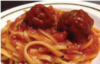
Spaghetti & Meatballs