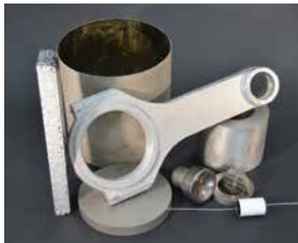
Parts made from Powdermet materials