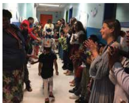
Parents, staff, and students cheer on our Kindergarten students in celebration of their first year at Imagine Bella. Way to go Kindergarten!

Imagine Bella is enrolling students for K-5. Visit the school now to learn more about our mission and the difference of an Imagine Bella education.