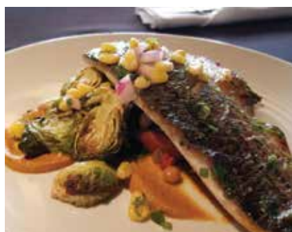
The canary rockfish was served in a smoked tomato fume, over a bed of Vidalia and lemongrass risotto

onion risotto with fresh tomato and herb consommé. My partner had the 7 ounce certified Angus beef filet served with fingerling potatoes, seared asparagus, fried onion, and tomato garlic confit. Both were scrumptious.