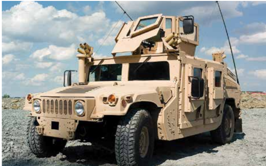
Terves' S-Comp product used for creation of armor plating for the U.S. Army's humvees

Essentially we operate in two different manners. On one front, we are doing funded research to create new technologies for both government agencies and industry. In this scenario, we may be working on specific technology for NASA for the Mars Mission or creating a new material for a major oil company to meet specific downhole application needs. On the other front, we actively sell magnesium and other component materials that we manufacture to companies serving the oil and gas exploration industry. These materials have unique properties that make them ideal for creat-