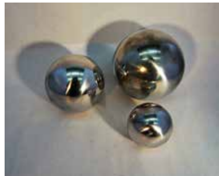
TervAlloy dissolving frac ball

ing tools for downhole exploration work.