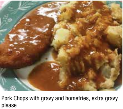
Pork Chops with gravy and homefries, extra gravy please