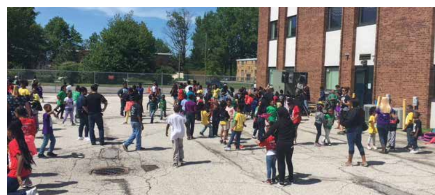
Congrats to house winner Ujima! Who will win next year?

At the end of the year Ujima house party, all staff and students came outside to join the dance party and celebrate the end of the year!