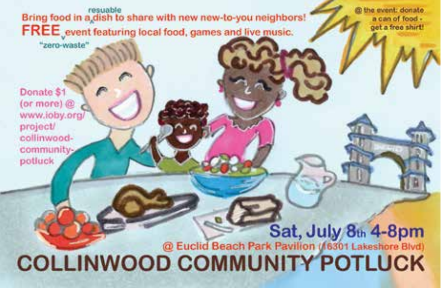
Bring a dish, a canned good and your appetite to the Collinwood Community Potluck on Saturday, July 8th.

clid City Council meeting. Thank you Bike Cleveland and thank you everyone for your enthusiasm and support of Bike Euclid! June concludes with our annual Bike to the Beach Party and Campout. Bike Euclid has no events planned for the month of July. As always, go to www.bikeEuclid.org and www.facebook.com/euclidbike for resources, safety information and local and regional events. In closing please consider the fact that a strong biking community produces significant social gains; improves overall health, reduces mental health problems, provides access to employment, significantly lowers household transportation costs, lowers air and noise pollution, and increases social cohesion.