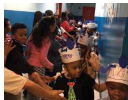
Kindergarten students were cheered on by older students on the third floor. Congratulations Kindergarten students for finishing your first year as Imagine Bella dragons!