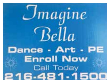
Have you seen our signs in your neighborhood?

Imagine Bella staff have been visiting local business, libraries and different events in the community. You will see us carrying flyers, bracelets, yard signs, house shirts, and enrollment packets. Connect with us on Facebook and let us know where you have seen us or our signs!