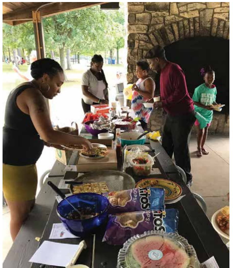
The first Collinwood Community Potluck on Saturday, July 8th was a success!