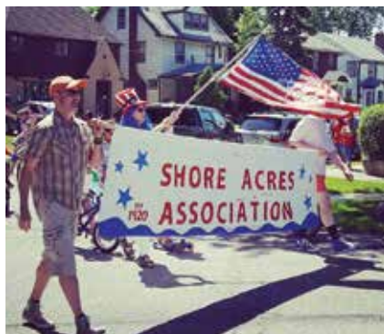
After nearly 100 years, the 4th of July celebration at Shore Acres is still going strong!

Thanks to the glorious weather, wonderful neighbors both past and present, and the best volunteer crew out there, the 2017 Shore Acres 4th of July celebration was a huge success. The parade stretched for almost a full block! The 400 picnic-goers were entertained by wonderful live music and enjoyed traditional favorites off the grill along with watermelon and amazing desserts contributed by neighbors and