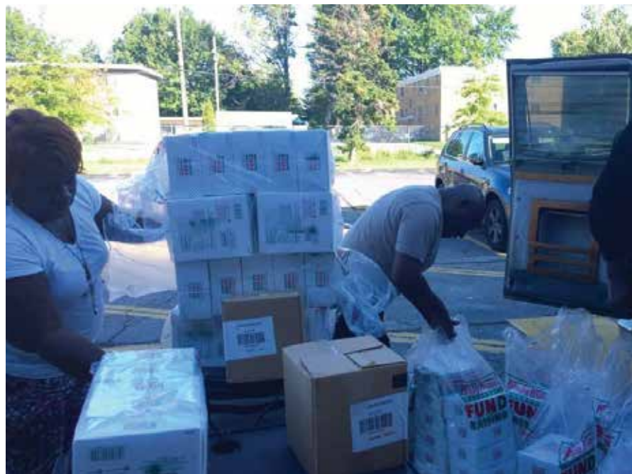
PTO members unload the delivery for the Krispy Kreme fundraiser last year.

Imagine Bella PTO is looking for new members for the upcoming school year! You can learn more about the PTO at Meet and Greet on Tuesday, August 15th from 6-7 pm. Being