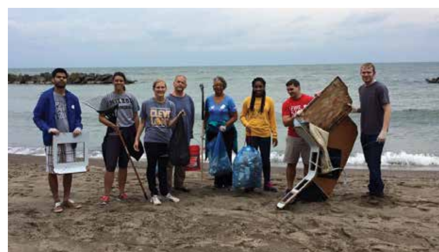
Volunteers show off their haul from Euclid Beach at last year's International Coastal Cleanup Day!