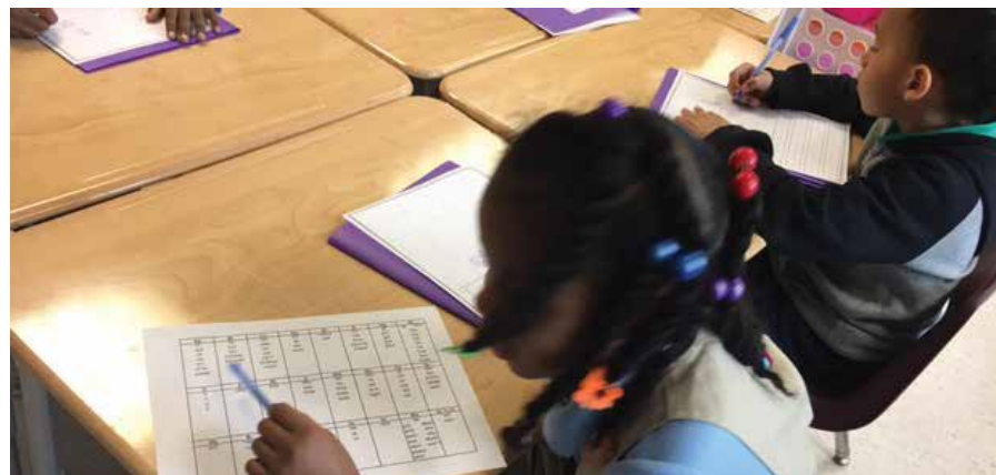
Kindergarten students love writing and use their personal word walls to help them tell their stories. Visit the school for a tour and to learn about how your child can join the Imagine Bella family.

Early Kindergarten Testing will be held on Friday, August 11th from 1-2 p.m. for students that have late birthdays. Students must turn 5 by December 31st,