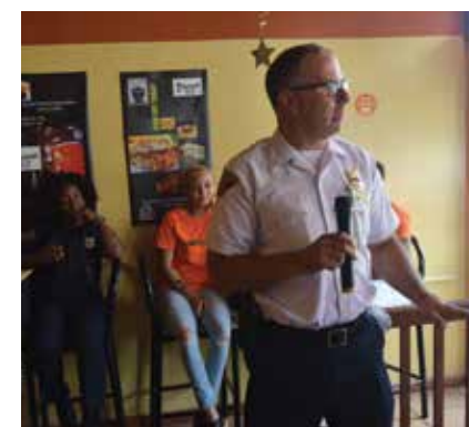
Community Day Meeting

Team Young is learning to write Neighborhood Connections grants to assist with their community project ideas of bringing positive changes to Collinwood, as a part of their workforce development, leadership, and Nonprofit training. It is a joy working with the fresh positive energy of young adults who are willing to work to their goals. The work that Team Young does and offer to small businesses include Administration, Marketing, and projects dealing with Community Development. Team Young called a Community