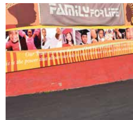
Family 4 Life Center on 148th and St Clair