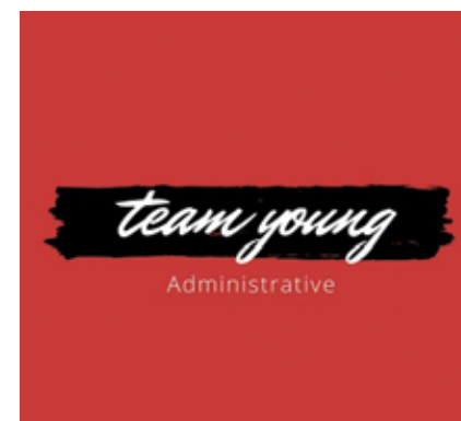
Logo for Youth Leaders "Team Young"

impact for Southwest Collinwood. Community Clean ups and Street Club Registration is the 1st project that occurs monthly to May of 2018, Food for Youth is the second project. Community Clean ups and Street Club Registration is the 1st project that occurs monthly from September 2017 to May of 2018, Food For Youth is the second project that offers healthy breakfast for Collinwood students or young adults to stop in the St Clair City Center on the way to school or work at no cost, and the third project is a new digital community board that will sit on the outside side wall of the Family 4 Life Center Building advertising businesses or events conveying messages to people traveling St Clair. Ultimately the group of students vows to call