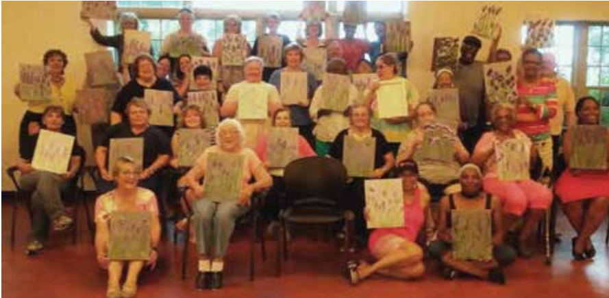
PPP pizza painting party at Euclid Senior Programs...Our Beautiful Lakefront Community center YOU should be in the empty seat! We are doing this again back by popular demand in September.

Community Police Talk Thursday, August 10th at 12:15 p.m. “Cop –a- Question” – Immediately after Lunch. Members from our Police Department