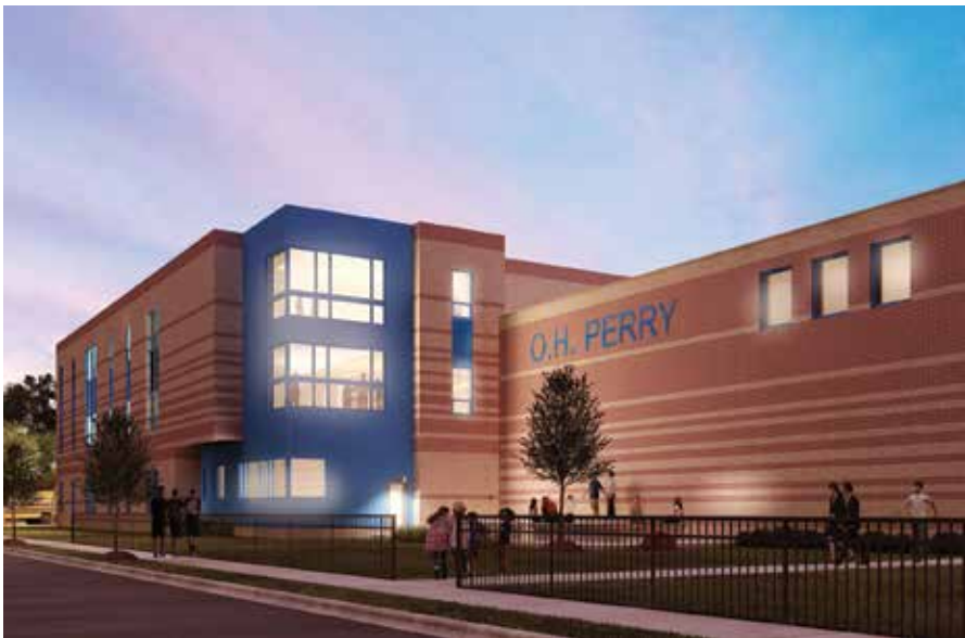
This rendering shows a new Oliver H. Perry School building that is scheduled for completion in 2018.