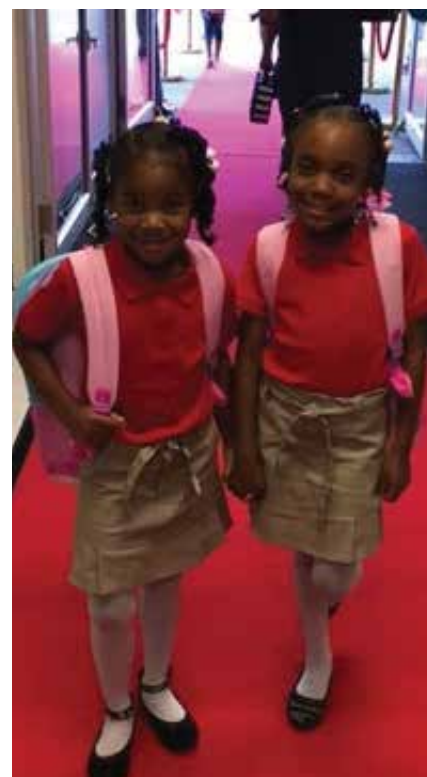
The red carpet will be back when Imagine Bella kicks off the school year!