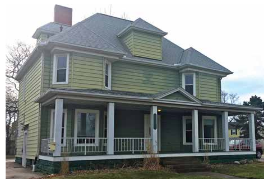
The Green House at 20150 Lakeshore Blvd. in Euclid