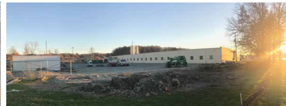
Keene Building Products, Euclid, Ohio, expansion

Keene was started in 2002 as an importer but quickly began development of its production line. Although educated as an accountant, Jim Keene, the founder, became involved in the engineering of the system to produce the materials -- a unique plastic extrusion process. Sales were simple since he was involved with many of the customers in the market.