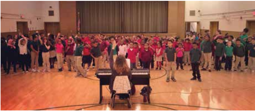
"We Are the World" performance by Lakeshore students.