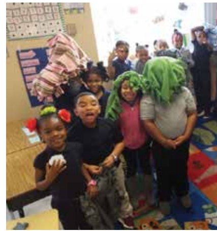
Second graders made blankets for the animal shelter.

Character Education is an important part of the curriculum at Imagine Bella Academy of Excellence. Each classroom completed a service learning project to help the