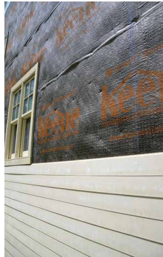
Drivall™ Rainscreen 020-1, a drainage mat for exterior wall systems