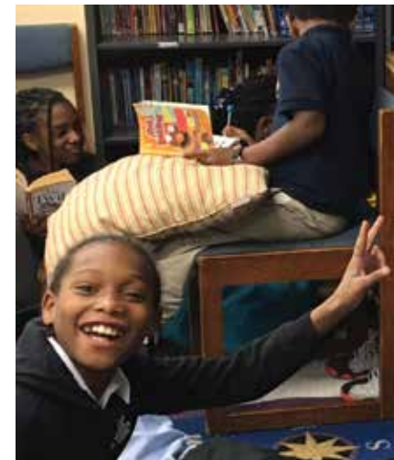
Students find a comfortable spot to read in the Advanced Reading Challenge (ARC) club.