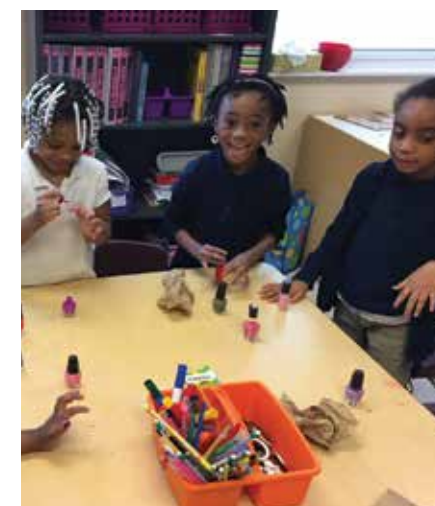
Time to get fancy with Nail Polish club!