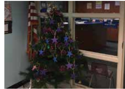
Watch for the tree next December!

Each year before winter break, Imagine Bella's Families Helping Families giving tree displays ornaments of items needed by Imagine Bella students. Families and staff members anonymously donate uniforms, coats, boots, and toys to help the students in our Imagine Bella community. Each item is wrapped up for families to take home on the last school day and open during the holiday season.