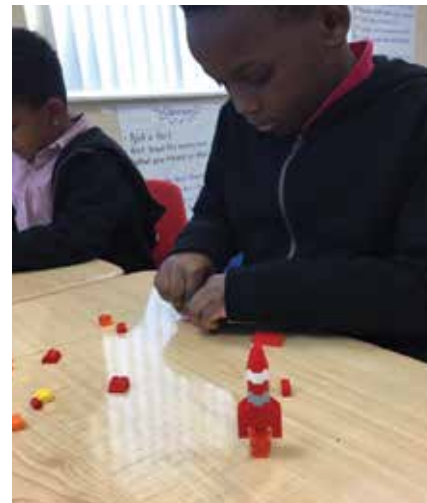
Lego club fun. Let's get building!