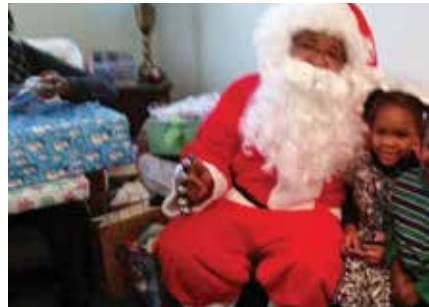
Kids visit with Santa