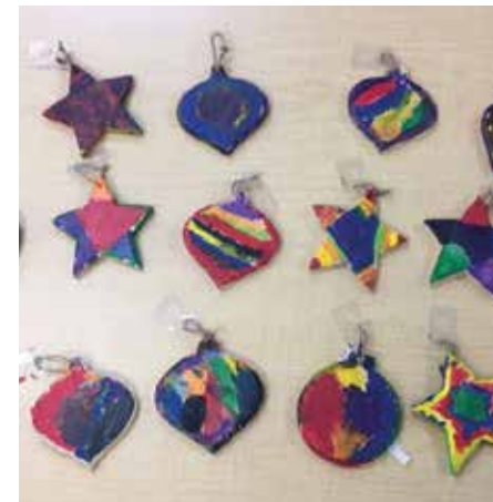
First graders painted ornaments and sold them with proceeds going to Laura's house.

Character Education is an important part of the curriculum at Imagine Bella Academy of Excellence. Each classroom completed a service learning project to help the