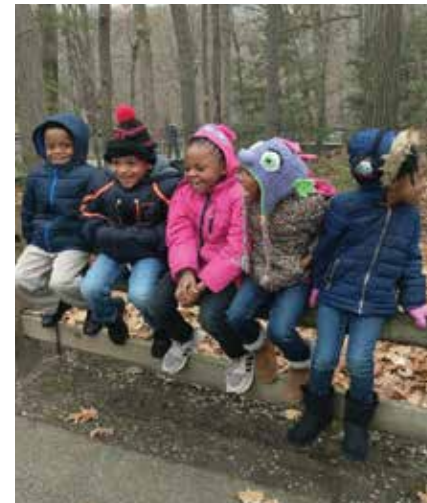
Bundled up and having fun at the Cleveland Zoo!

The cold weather may be here in Cleveland, but that doesn't stop our fun! Imagine Bella students in many grade levels had field trips to the Cleveland Zoo in December. Stu-