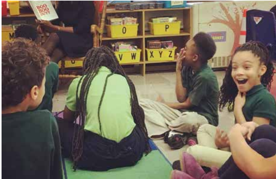
A Junior Cluster student's mother joined us as a "Mystery Reader."