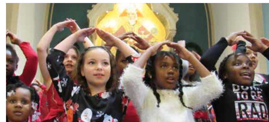
St. Jerome Third Grade students performed "Make Your Home in Me."