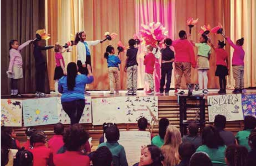
Opening Ceremony of the Winter Celebration of Learning, lighting of the Olympic torch.

and Junior Cluster classrooms. "Mystery readers" share a favorite story with their child's classroom. Our last day of school in 2017 included our Winter Celebration of Learning. This year's theme was the Winter Olympics. Each classroom learned about and performed a Winter Sport (everything from Lugging to Snowboarding!). As we strive to be spirited citizens within the community, our school community collected 75 pounds of food items during our Celebration of Learning which have been donated to the Cleveland Food Bank. The Winter Celebration of Learning ended with a rousing performance of "We Are the