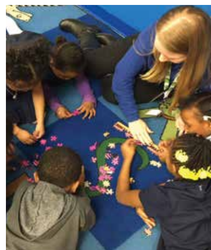
One piece at a time with Puzzle club!

Friday clubs are up and running. Pictures show some of the clubs in action!