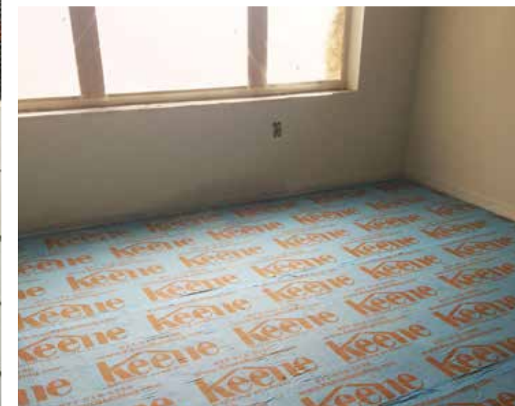
Quiet Curl® 55/025 MC sound control mat designed to limit impact noise between floors