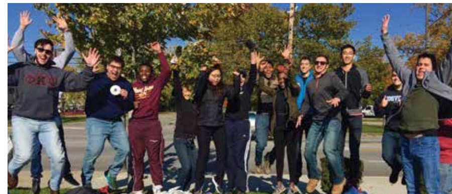
Help plan the “Big Clean” during the ‘Keep Euclid Beautiful’ meeting on Wednesday, January 17th, 2018 at 6pm at Euclid City Hall (585 East 222nd Street).