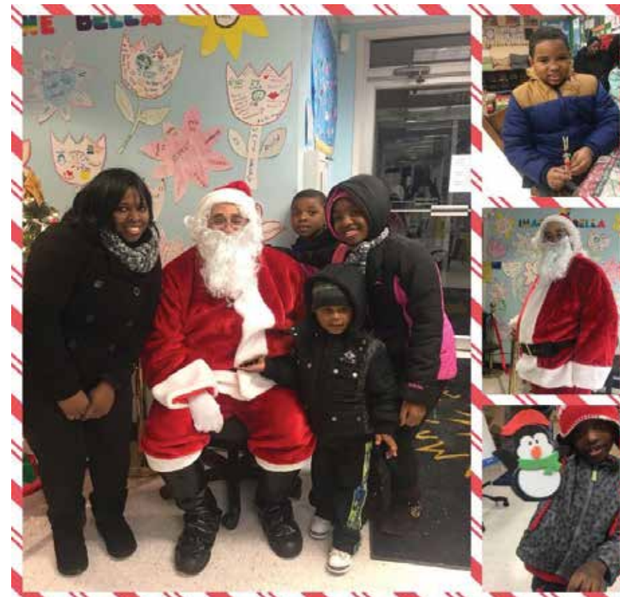
Crafts, Food, and Fun during the Winter Art Walk at Imagine Bella!