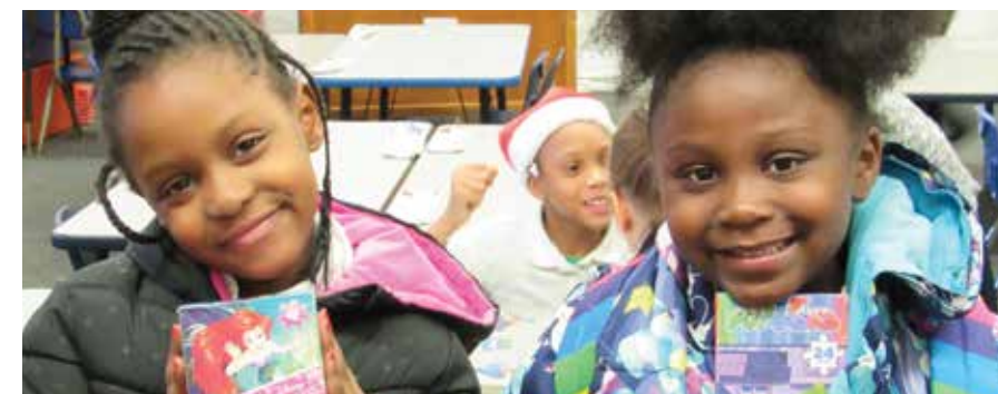
Cherysh and Love show off two of their favorite puzzles.