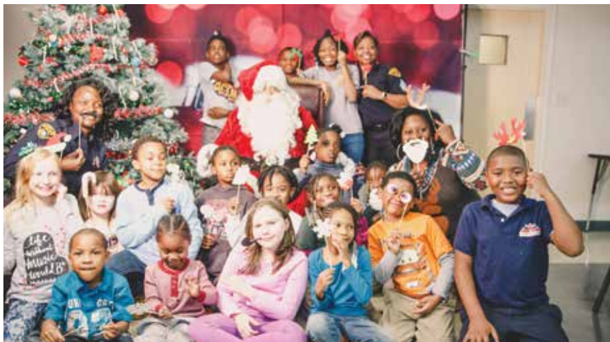
Crafting with Cops youth Group Photo

Collinwood & Nottingham Villages Development Corporation Christmas crafts brought Christmas cheer. Collinwood & Nottingham Villages Devel-