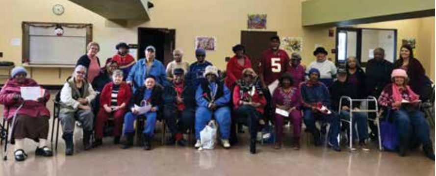
Aging Mastery Program participants at Lakeshore Rose Center