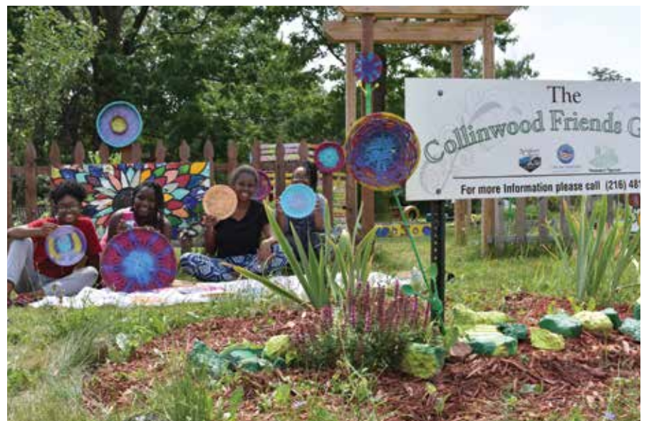
Students upcycled baskets into flowers to brighten our entrance way!