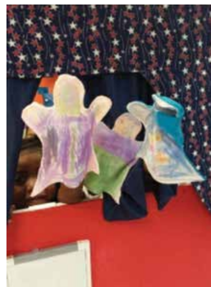
Time for the Puppet Show!