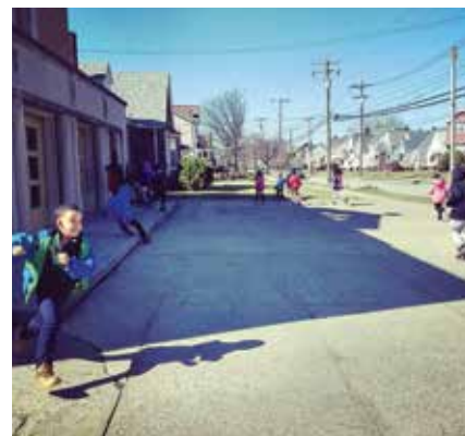
"Brain breaks" are always better outside!