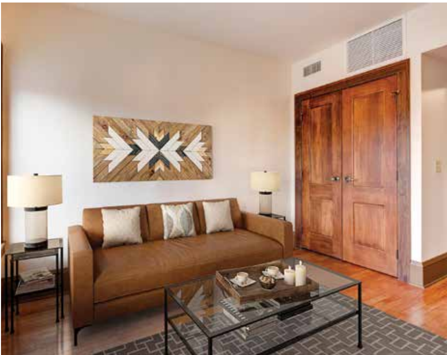
Refinished hardwood floors...