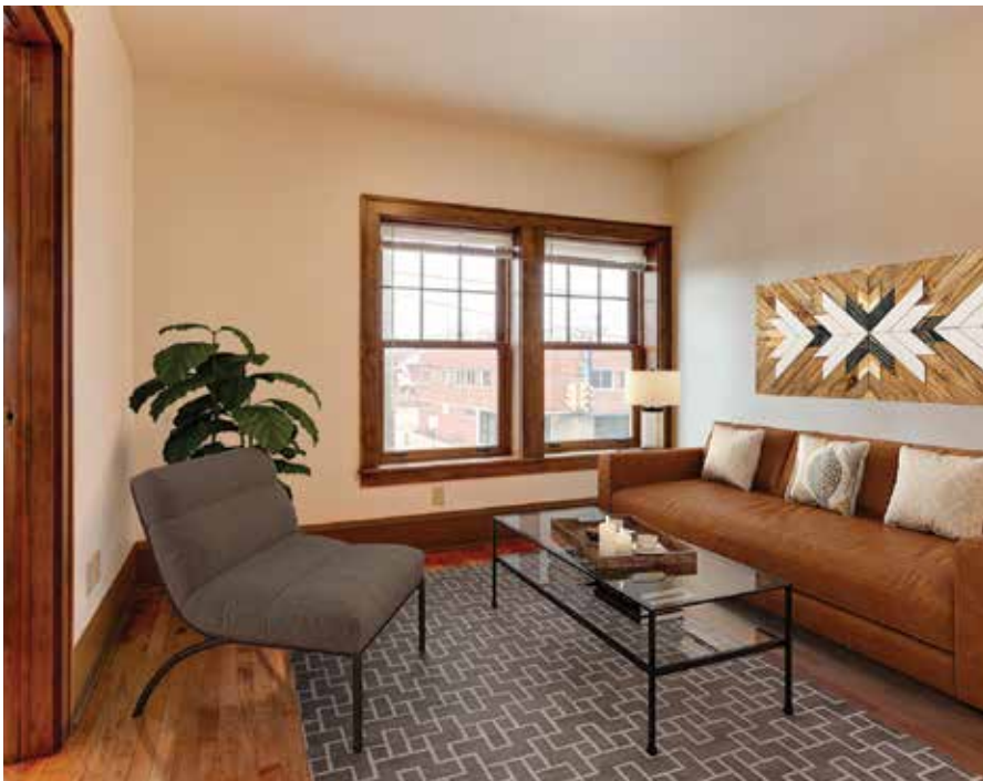
Beautiful vintage woodwork!

institution!” Residents will enjoy the view from above the historic marquee, as well as the carefree lifestyle which comes with the meticulous rehab... Beautiful original hardwood flooring and spectacular woodwork highlight the original features – but everything else is brand new – heating, A/C, windows, kitchen, bathroom, appliances... And- there’s more – the third floor holds a common area with on-site laundry, a perfect spot for relaxing and overlooking the streetscape in a setting accented with exposed brickwork and recreated leaded-glass windows - designed and created by local Azure Stained Glass Studios! Location, location, location! The LaSalle is in the corridor of activity – the E 185th independent bistros and cool eateries are a stone’s throw away... and so close to Metroparks, Lake Erie, freeways, transportation, bike trails, medical, Waterloo Arts District, 15 minutes from downtown or University Circle. There is sooo much to love about this area! The suites are being marketed by the Klimas Group of Keller Williams Greater Cleveland. For more info please call Neris Klimas (216) 315-0356.