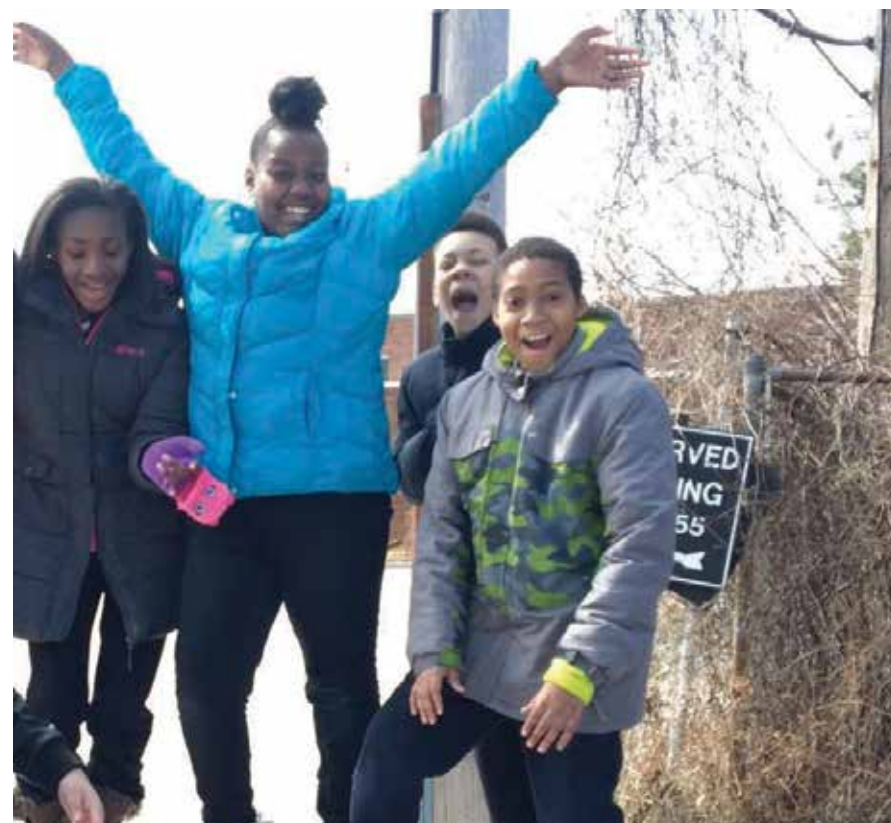
Students enjoying some winter fun outside!