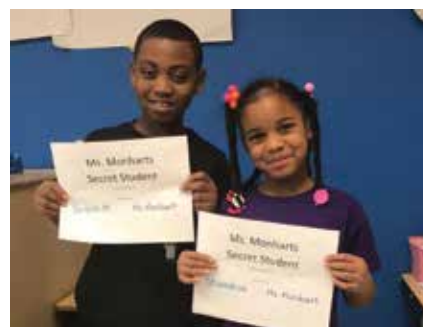
Congrats to these Secret Student winners!

Imagine Bella students know how to be Rock Star Students and their teachers are taking notice! Check out these photos of