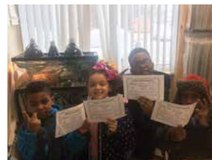
Rock Star Students shine in First Grade with these Positive Office Referrals!

Imagine Bella students know how to be Rock Star Students and their teachers are taking notice! Check out these photos of