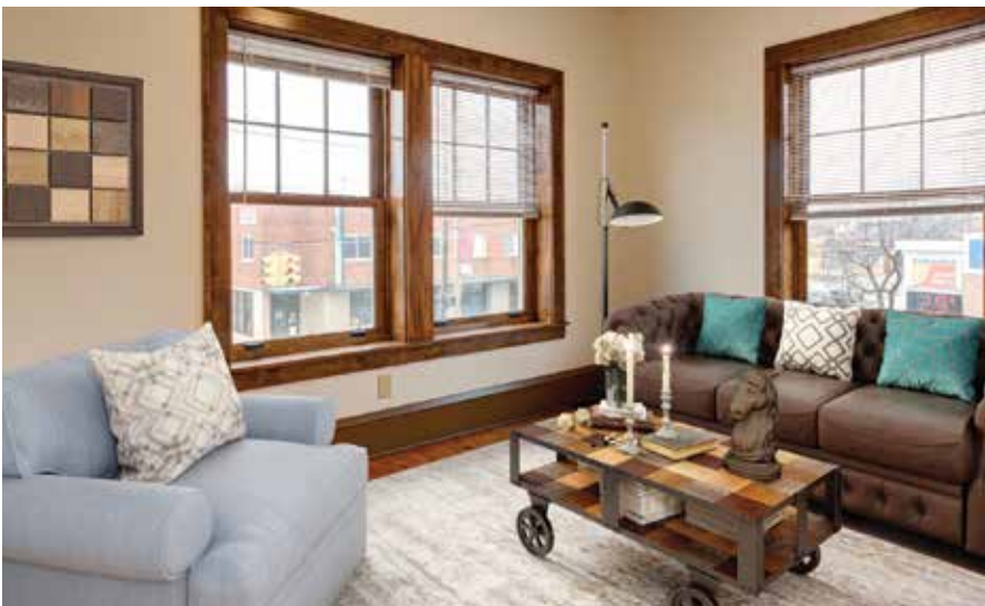
The best views around!