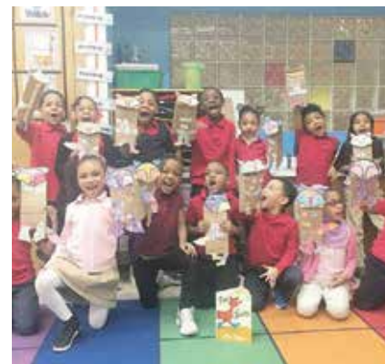
Primary Cluster created "Fox Puppets" as part of their "Read Across America" activities.