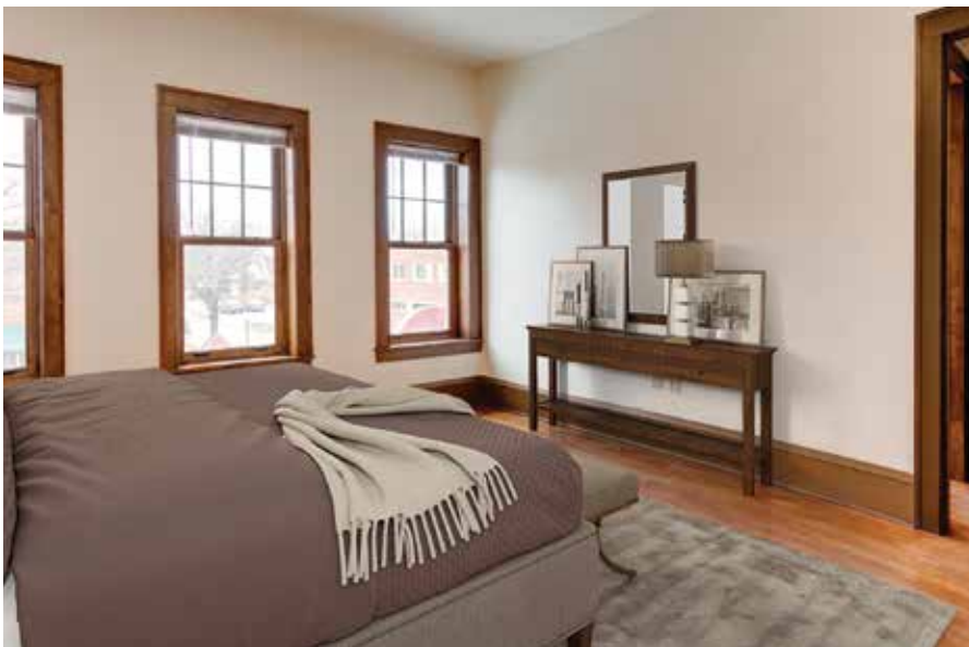
Bedroom bathed in natural light