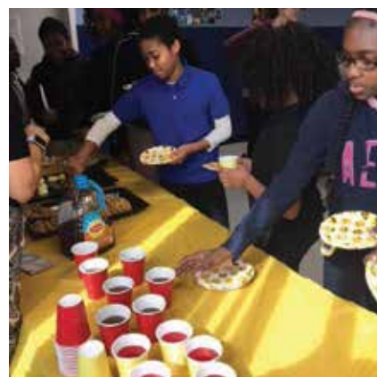
Time for a sweet treat for our Character Essay Winners!

Each year, Imagine Bella students in grades 3-6 participate in the National Imagine Character Essay contest. Students craft essays in response to provided maxims with a focus on character. The essays are edited by peers and final drafts are typed to send for