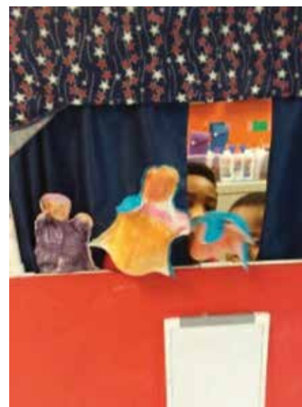
Kindergarten students created their own puppets in Art.

Kindergarten students at Imagine Bella created puppets during their Art classes with Art Teacher Mrs. Heston. After their puppets are done it's time to put them to