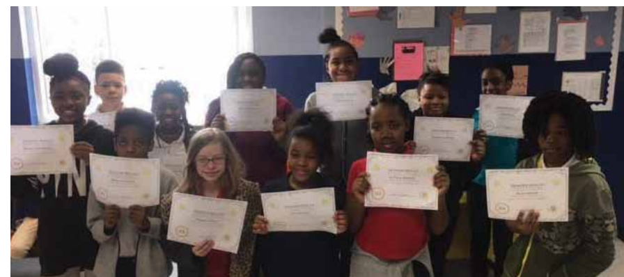
Congratulations to all our school level winners!