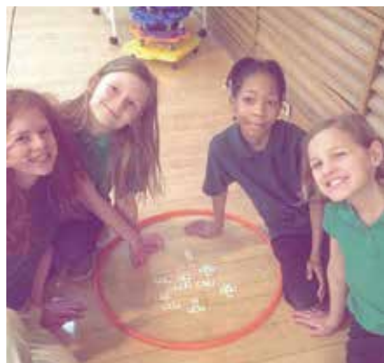
We also exercise our brain in PE.