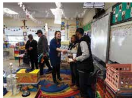
OUR LADY OF THE LAKE SCHOOL – REGISTRATION 2018-2019

WE ARE NOW ACCEPTING APPLICATIONS FOR OUR 2018-2019 SCHOOL YEAR. IF YOU HAVE A CHILD IN PRESCHOOL THROUGH GRADE 8, OR KNOW OF SOMEONE LOOKING FOR A TREMENDOUS, FAITH-FILLED EDUCATION PLEASE DIRECT THEM TO OUR LADY OF THE LAKE SCHOOL.