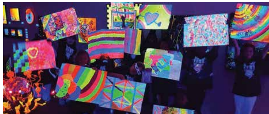
Our students beautiful DayGlo Creations.