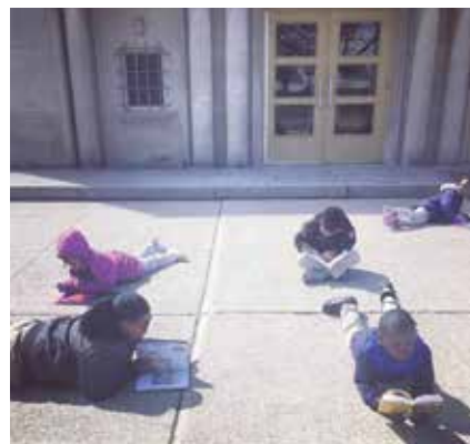
Spring weather means we can do SSR outside!