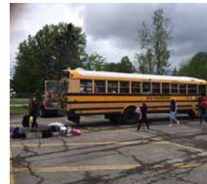
Heading to camp. Time to load up the bus!