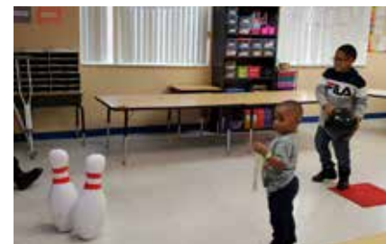
Fun and games at the carnival!