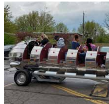
Time to ride the rocket car!