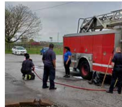
Check out the Smokehouse