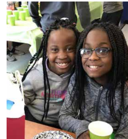
Character Essay contest reception celebrated our school level winners!