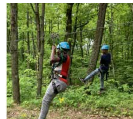
Ziplining at Skyview Ranch

May was a busy month with many field trips including camping at Skyview ranch for 3rd, 5th, and 6th Grade. Check out some of the photos from our adventures!