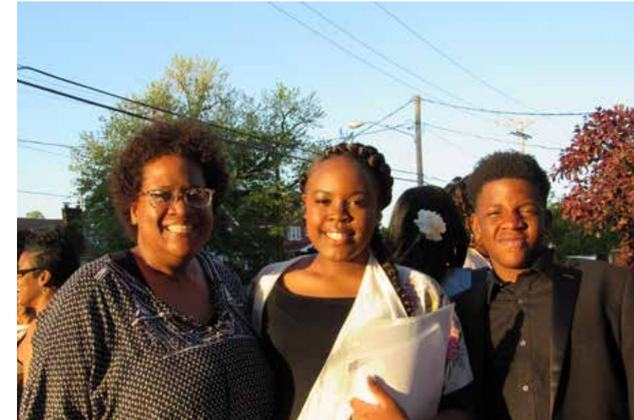
Another class joins the ranks of St. Jerome Graduates. We look forward to hearing of their future accomplishments.

Communion, a concert, May Crowning, graduation and the end of the school year the month just flies past.