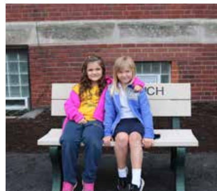
OLL Students worked hard to earn a Buddy Bench for their school.