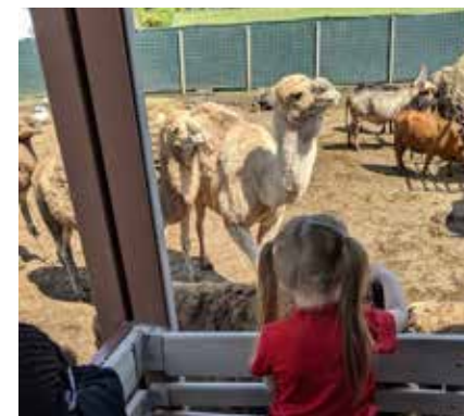
Wagon trails safari with Kindergarten