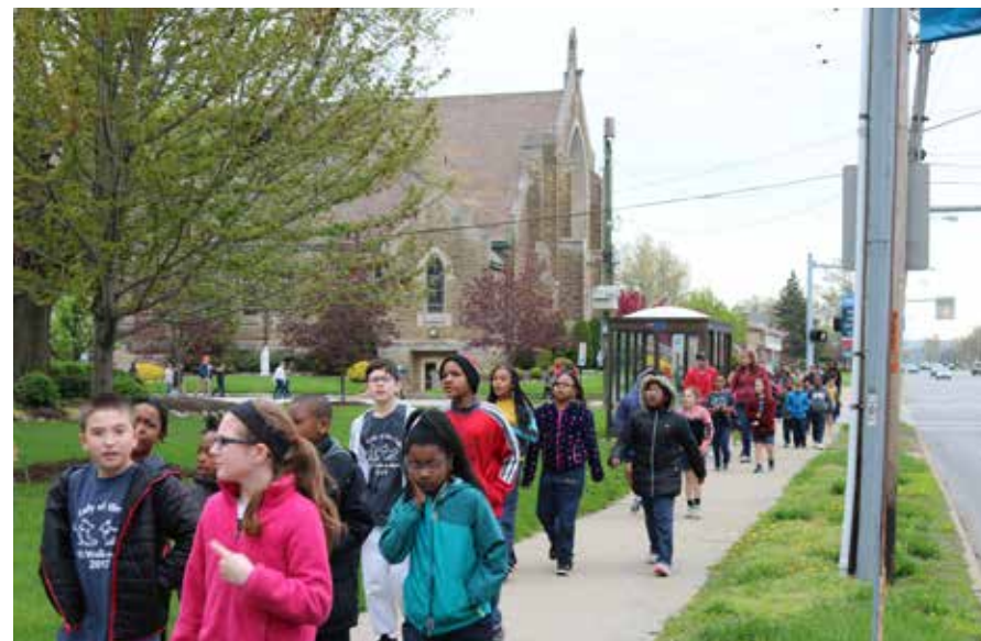
OLL School students walk the neighborhood amid signs of support and cheers from neighbors at the 2019 Walkathon.