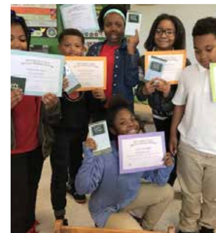
Congratulations to all the Advanced Reading Challenge finishers!