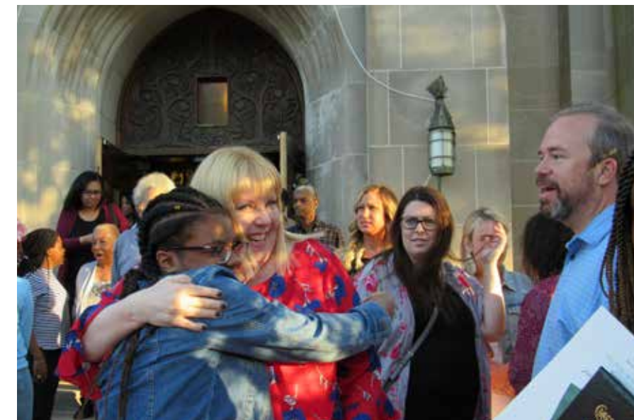
Family and friends gathered to celebrate the 8th Grade Graduation Class of 2019!