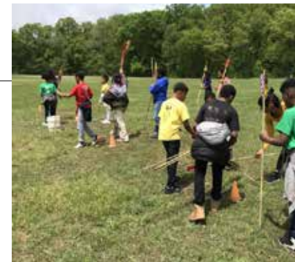
4th grade field trip