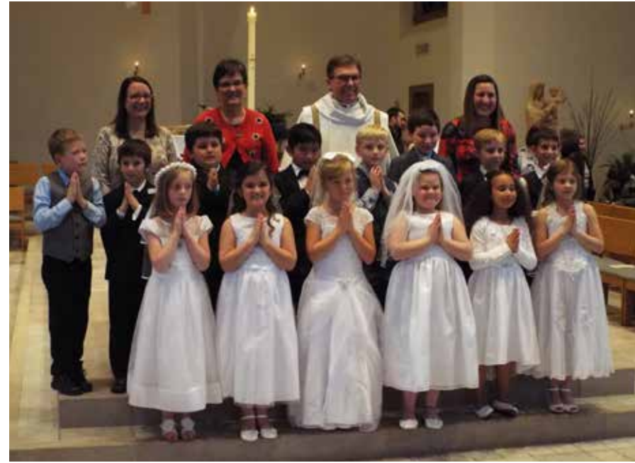
Congratulations to the First Communion Class of 2019 and their families.