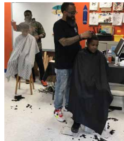
Thank you to the 2 Dad's and Grandpa who came to give free haircuts. Thank you to Mirror Image Barber shop