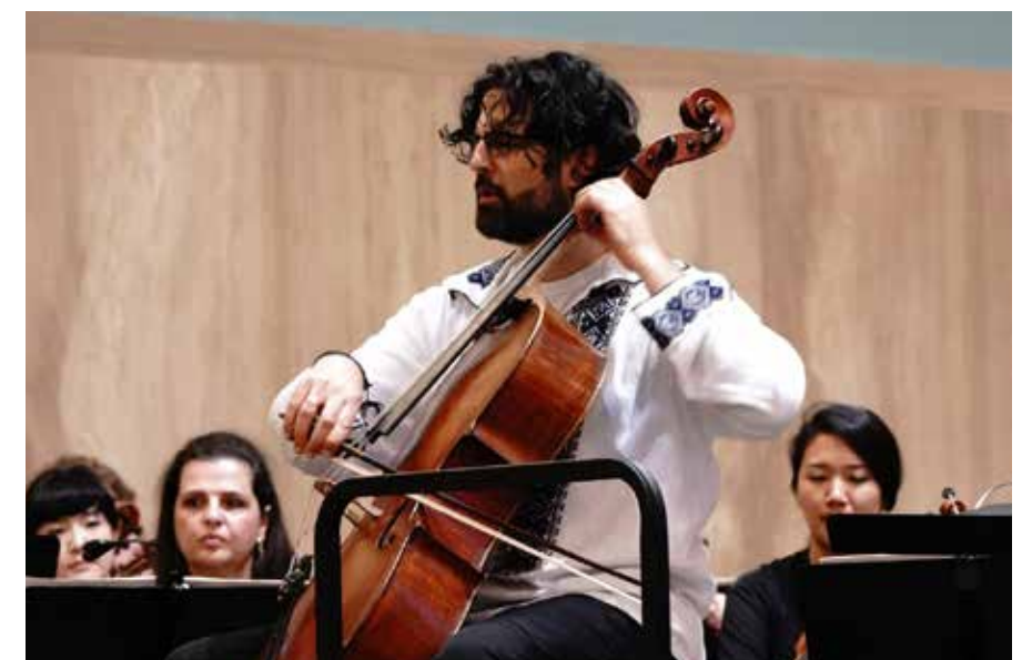
Amit Peled on the cello was positively amazing performing Saint-Saëns Cello Concerto No.1, Op.33. It was a delight.