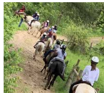
Horse ride through the trails!