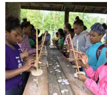
4th grade field trip