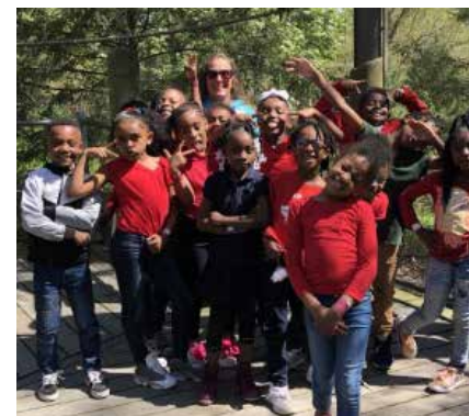
1st grade at the zoo