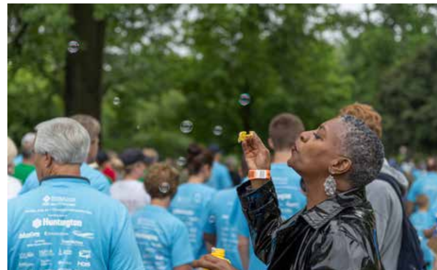
Celebrate the memory of a loved one while supporting special programs Hospice of the Western Reserve provides in our community.