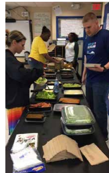
Thank you to the Observer for helping celebrate our teachers during Teacher Appreciation Week with a Chipotle Lunch!