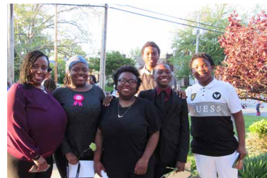
Congratulations to all our graduates and their families! Well done!