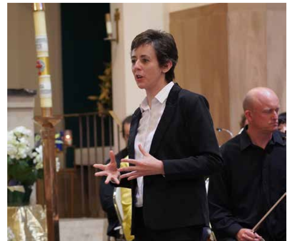
Amit Peled on the cello was positively amazing performing Saint-Saëns Cello Concerto No.1, Op.33. It was a delight.

CONTACT US | stjeromecleveland.org | Follow us on Facebook | Phone: 216-481-8200