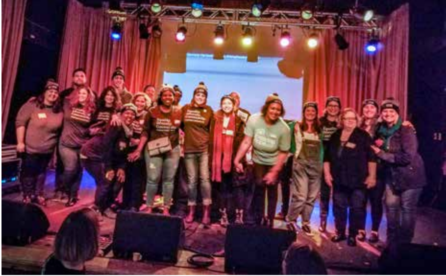
#GivingTuesdayCLE nonprofit partners and volunteers take the stage