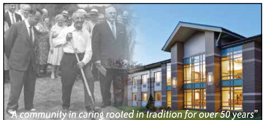
Architect: Herman Gibans Fodor, Inc. – Architects

The Lake Erie Folk Fest is a program of the Northeast Ohio Musical Heritage Association, which also produces the Blue Sky Folk Festival in Willoughby, along with other traditional music events and programs throughout the year. It is presented at Shore Cultural Centre, which offers a wide variety of cultural and educational opportunities, which include classes, studio rental and performances. The festival attracts roots music lovers from Ohio, Pennsylvania and beyond, as well as residents from Euclid, Cleveland and surrounding communities. For more information, visit www.lakeeriefolkfest.com .