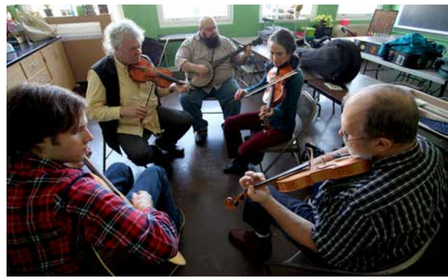
Award-winning bluegrass band Carolina Blue will headline the Saturday night concert, as well as offering master classes and educational performances.