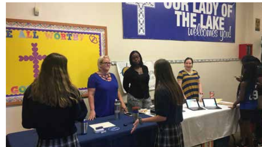
OLL PTO greeting visitors.

In addition to OLL's award winning curriculum, OLL's is proud of the supportive faith community of caring teachers, involved families and active