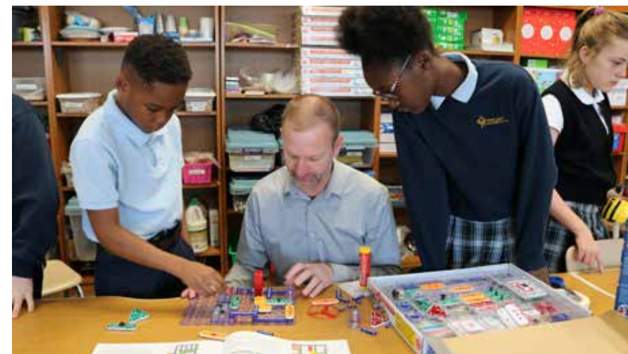
Students with STEM teacher.