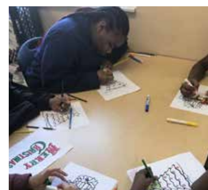
6th grade made placemats for residents at a local nursing home!

Thank you to the PTO for helping us decorate the halls for the month of December! We even had some students show off their tree setup skills. Teachers brought in presents for the return of the Mystery Gift Raffle. Thank you to all the families who donated and helped wrap presents for our giving tree. Hope all the students, families, and teachers of Imagine Bella had a great winter break!