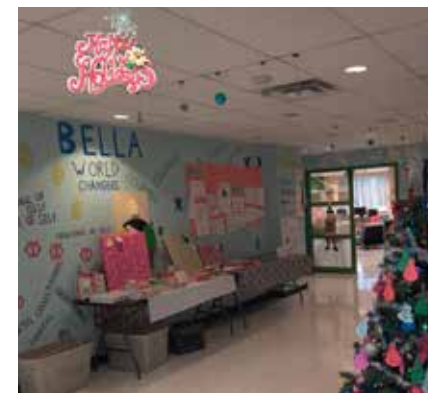
Mystery presents and our giving tree for December.

Thank you to the PTO for helping us decorate the halls for the month of December! We even had some students show off their tree setup skills. Teachers brought in presents for the return of the Mystery Gift Raffle. Thank you to all the families who donated and helped wrap presents for our giving tree. Hope all the students, families, and teachers of Imagine Bella had a great winter break!