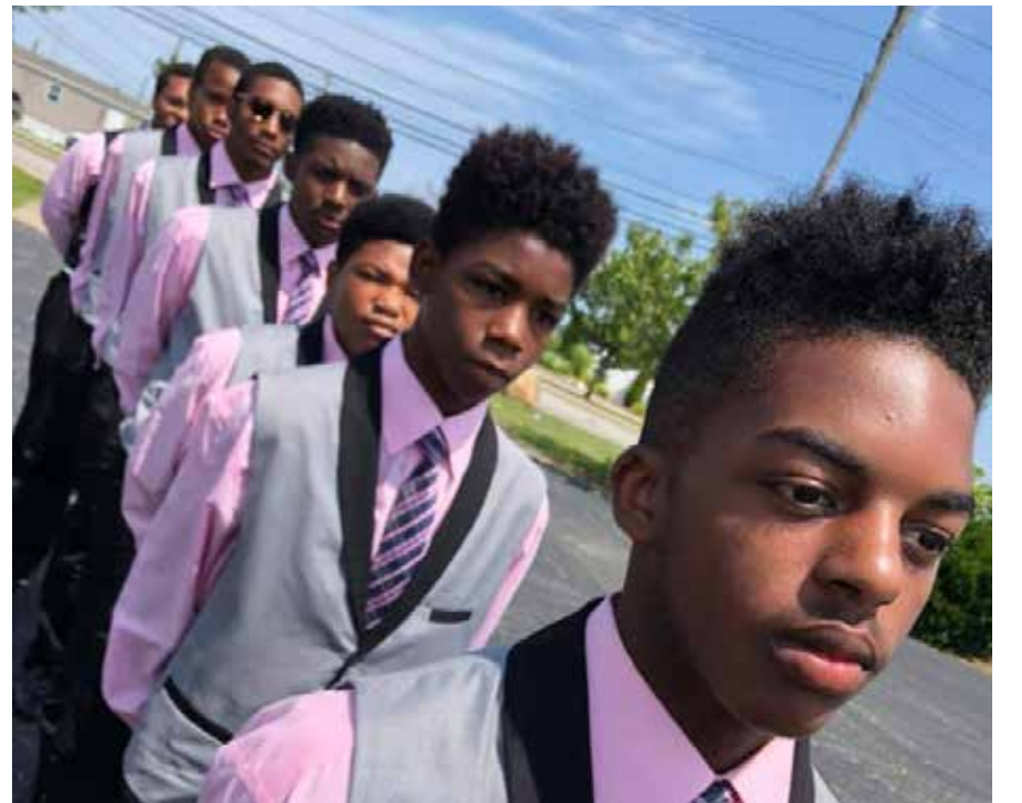
Distinguished Gentlemen of the Spoken Word will be among the many talented performers at the Lake Erie Folk Fest.

pel, all done in the traditional style. Their most recent Pinecastle Records release, I Hear Bluegrass Calling Me, debuted on Billboard's Top 5 Bluegrass Albums chart, and they were nominated in five categories at this year's International Bluegrass Music Awards. Young audiences will get a special opportunity to hear Carolina Blue when they kick off the festival with an educational program the morning of Feb 21, supporting LEFF's mission of bringing cultural opportunities to the community. Dedicated musicians can actually play with the band members on Friday evening, when Carolina Blue will host an exclusive Band Lab Master Class, offering serious students a unique opportunity to study fiddle, banjo, mandolin, guitar and bass with some of the best in the business. The rest of the public can get in on the act Saturday night, when Carolina Blue headlines the festival's impressive evening concert line-up.