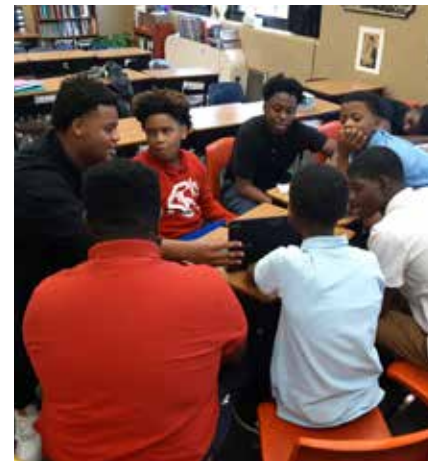
8th graders hard at work on a group project

1. HISTORY. St John Nottingham is one of the oldest continually-operating parochial schools in Ohio, having opened in 1892 when the area wasn't even part of Cleveland. It was a small farming village named Nottingham. Over the last 120+ years, SJN