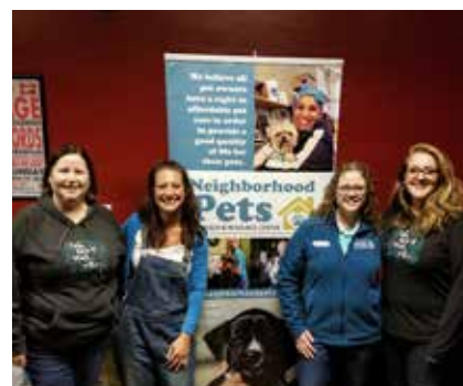
Neighborhood Pets Resource and Outreach Center, recently extended services to low-income pet owners in Collinwood