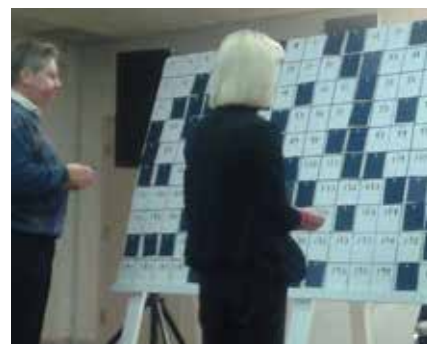
Who will be the big winner this year? Maybe you?