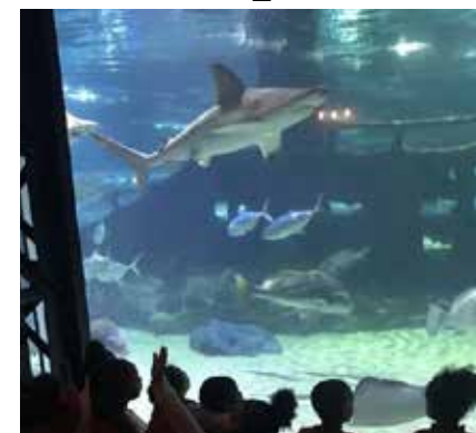
Kindergarten had a great time at the aquarium!