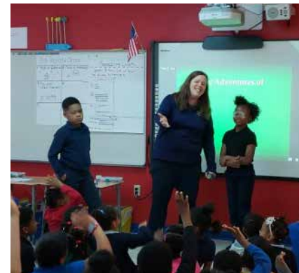
RealEyes meets with the 2nd graders and has some students help out in the presentation.

In December, more classes went to the Aquarium and we had presenters visit the school from RealEyes. Check out these photos!