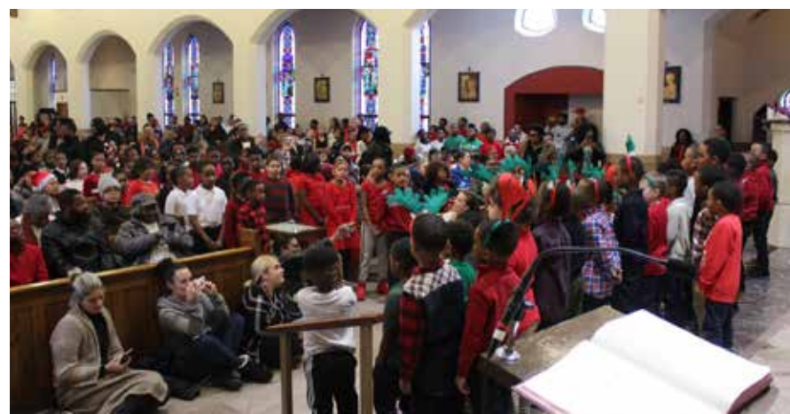
It was standing room only at the annual Christmas program.

Our 2019 St. Jerome School Reverse Raffle will be held at Tizzano's Party Center on Friday, February 14th at 6pm. Always a fun event, this year's raffle offers a grand prize of $2,500 along with side boards, an amazing basket raffle, and a delicious dinner. Get your tickets now by calling the school office at (216) 486-3587 or the church office at (216) 481-8200.