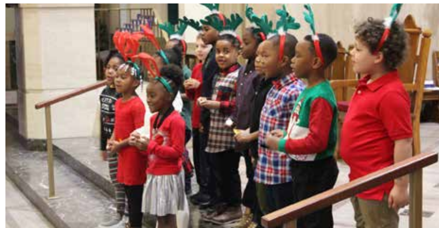
The students put on a wonderful show for their families and friends.

CONTACT US | stjeromecleveland.org | Follow us on Facebook | Phone: 216-481-8200