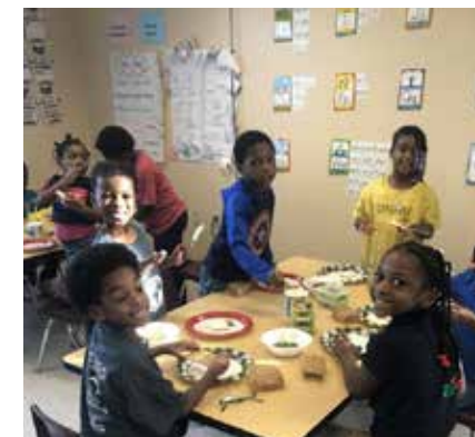
Gingerbread house fun in Ms. Eucker's room! Yum!

Check out some photos from classroom celebrations on the last day before break!