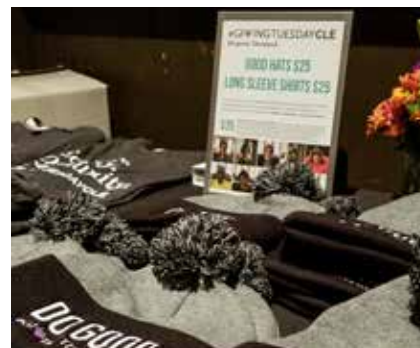
Good Hats still on sale at dogoodcle.org while supplies last

With the belief that we can do more together than we can do alone, WISH Cleveland is empowering Cleveland residents to "give local" in their communities. The "Do Good" carried a vibrant message amplifying that community change starts with us. With the support of students and staff at the Tri-C Mandel Scholars Academy, plans are underway to keep the good vibes going all year long through a #52TuesdaysCLE campaign launched on Tuesday, Dec. 31. To keep up with their weekly generosity challenges, visit wishcleveland.com or follow @wishcleveland on social media.