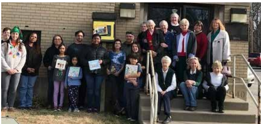
Church of the Gesu volunteers and board members, volunteers, and staff of CNCM.

together when are going through the issues of life I honestly believe it wouldn't be that hard to get through. We've lost so many innocent lives over the years that it seems impossible to draw strength from anywhere. I speak from experience when I tell you the storm don't last forever but while you're in this storm we must speak life into these situations and help uplift other people who are less stronger and less unfortunate than us. So no matter what you're going through or if you see someone else going through please "Speak Life" into their situations as well as your own.