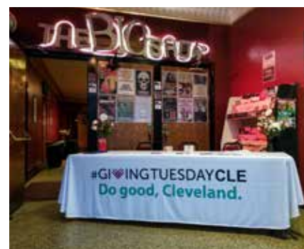
Beachland Ballroom entrance