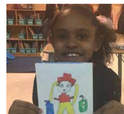
2nd graders made cards and care packages for firefighters!