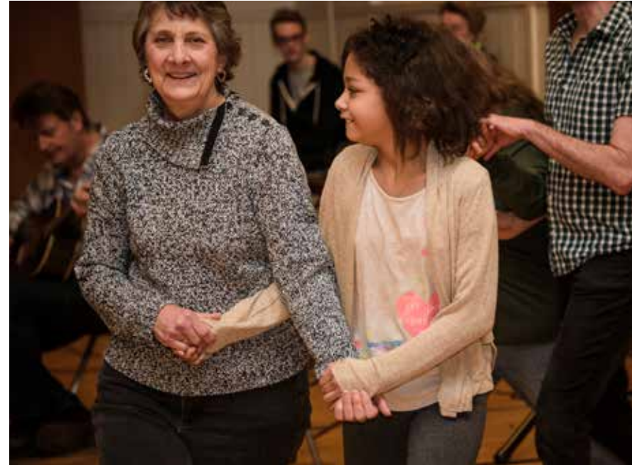
Dance workshops help both beginners and lifelong fans get in on the action.