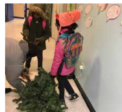
Students stop to help with tree setup