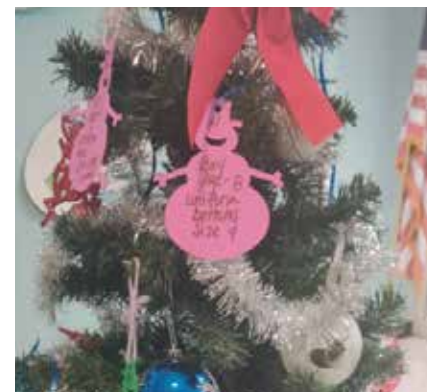
Thank you PTO for help with our Giving Tree this year!