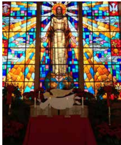
Angel Candle sets the Candlelight Worship theme