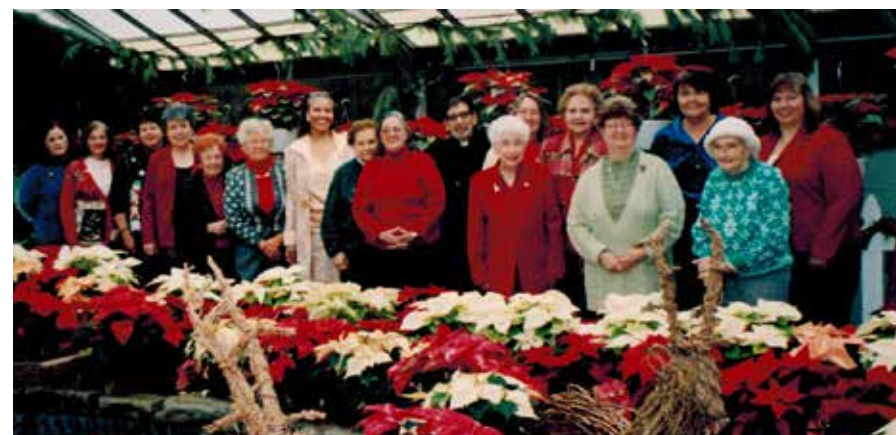
The ladies of the St. Jerome Altar & Rosary Society add so much to the life of the church! They regularly pray the Rosary together as well as providing the hosts and wine for Mass and maintaining the altar cloths. Every year during Lent they sponsor special events and services. Members raise funds for all of this through bake sales and by selling wonderful frozen strudel! This year they again got together at Shorby Club in Bratenahl to enjoy each others company.