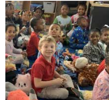
Kindergarten Pajama Movie Party!