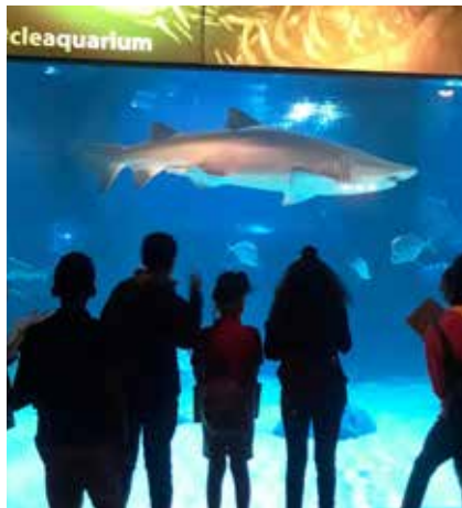
SJN Students at the aquarium.