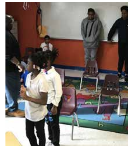
Adkeysiga trust game!