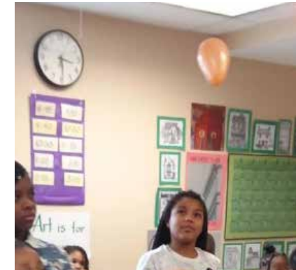
Igboya balloon game!