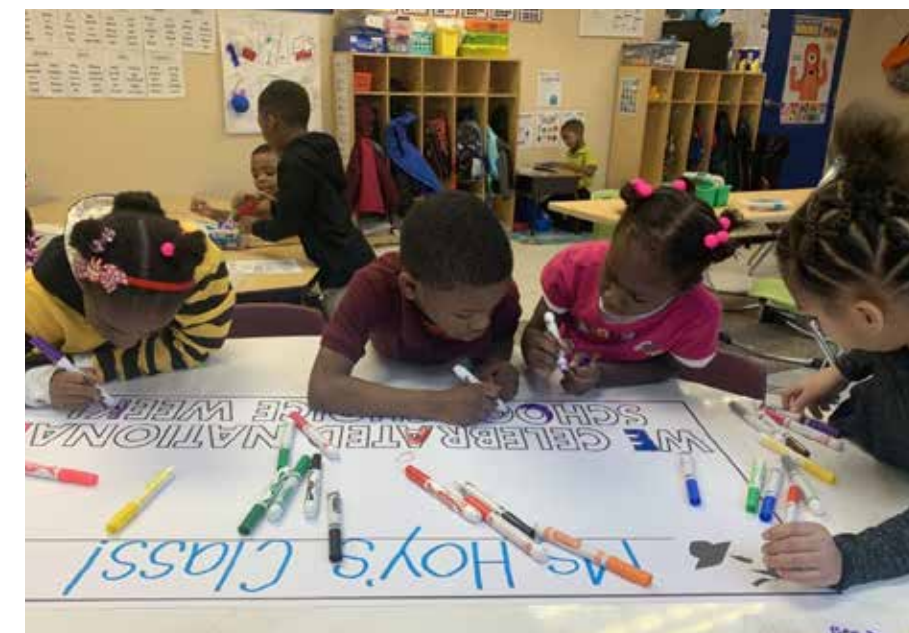
Preparing for our school parade!

Imagine Bella Academy of Excellence students are preparing for a parade to celebrate National School Choice Week! Thanks to all the amazing parents, students, families, and teachers for choosing to be part of the Imagine Bella Family!!