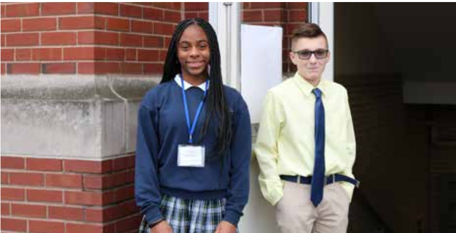
Our student ambassadors greet and guide families through our school.