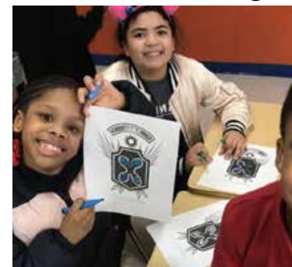
Ujima house meeting!