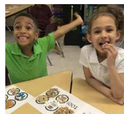
Time to enjoy some snacks on 100th day!

Imagine Bella Kindergarten students celebrated their 100th day of school! Check out some of the pictures of students in Ms. Hoy