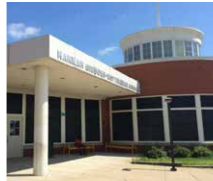
Families interested in enrolling students at Hannah Gibbons can learn more at open houses the school holds from 1 to 3 p.m. on the fourth Friday of every month.

Hannah Gibbons School is enrolling students for the 2020-2021 school year.