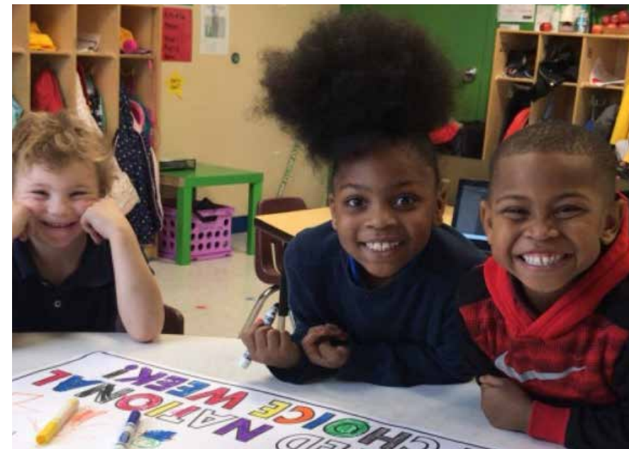
Time to make a banner for our parade!

Imagine Bella Academy of Excellence students are preparing for a parade to celebrate National School Choice Week! Thanks to all the amazing parents, students, families, and teachers for choosing to be part of the Imagine Bella Family!!