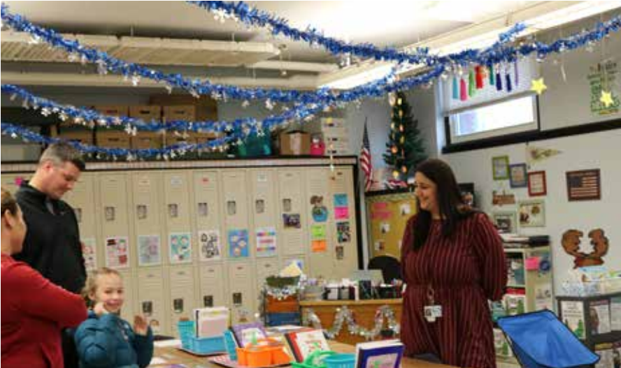
Teachers were on hand to answer questions and show off student projects.