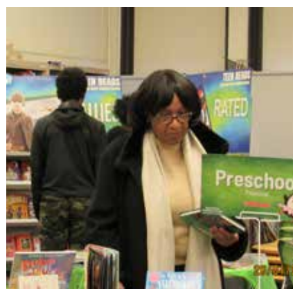
The annual Book Fair is always a popular stop. With so many titles to choose from there is truly something for everyone.

come back to visit childhood memories and see what the current students are doing. Parishioners and friends come to reconnect and catch up. Parents of prospective students